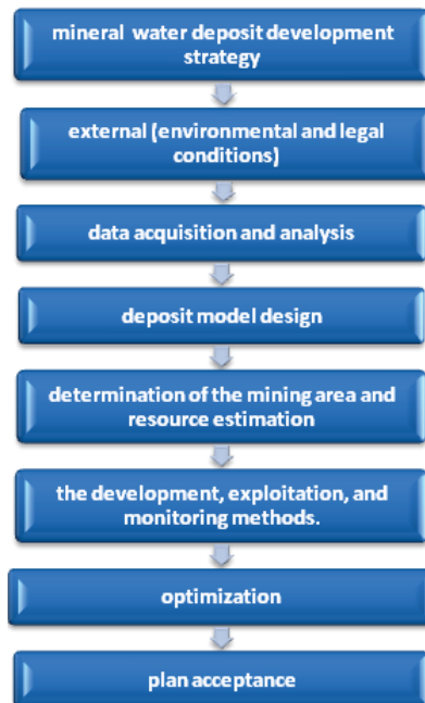
Fig. 3. Scheme of mineral water deposit development plan

Of all the above mentioned elements included in the mineral water deposit management process, the most important is the deposit development plan. The plan should be treated as a process that consists of many elements (Fig. 3).