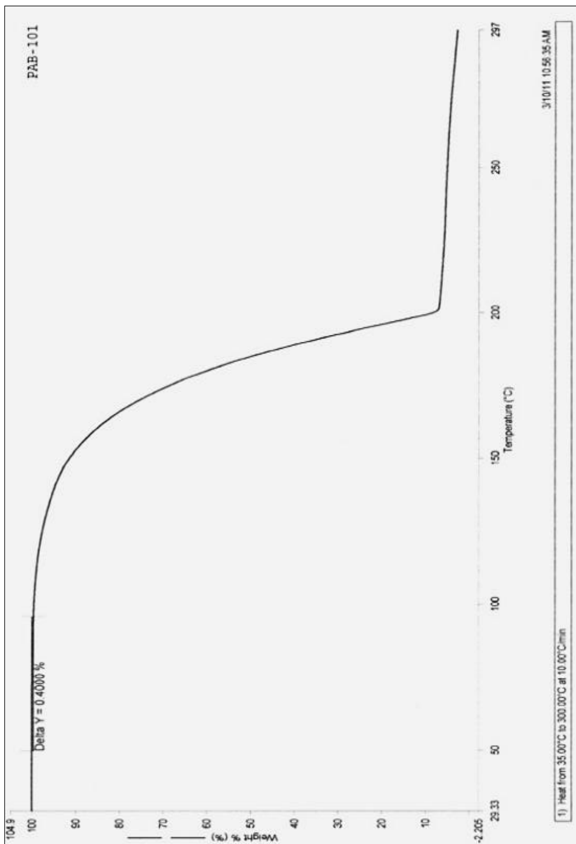
Figure 1. Themogram of PAB-101.