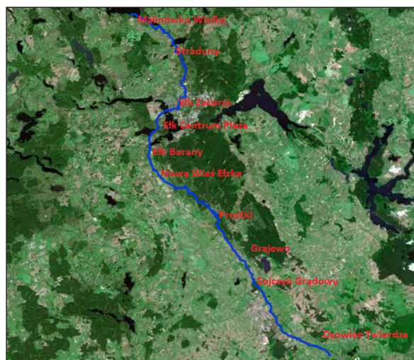
Figure 1. Localization of measurement points

Ten measurement points were selected on the river Ełk (according to main pollution sources as: sewage treatment plant, transport and surface flows from fields), from which samples of bottom sediments and macrophytes were collected. Samples of plants and bottom sediments from the river were collected during the extensive vegetation in 2014. The dominant species were: broad-leaf cattail ( Typha latifolia ), yellow water lily ( Nuphar lutea ), and cowbane ( Cicuta virosa ). Typha latifolia , Nuphar lutea , Cicuta virosa were transferred to laboratory, dried and prepared to analyzes. Samples of bottom sediment were subject to a sieve analysis. Each fraction (1.0 – 0.2 mm; 0.2 – 0.1 mm; 0.1 – 0.063 mm; 0.063 – 0.02 mm; < 0.02 mm) was combusted in an oven at about 550 °C, then mineralized in teflon containers in aqua regia . The nickel content was determined by means of ASA with inductively coupled flame on spectrometer Varian Spectr AA 100. Macrophytes were divided into parts (leaf, stem, root) and subject to combustion in an oven at 550 °C. The achieved ash was digested in nitric acid and 30% hydrogen peroxide in a digestion block.