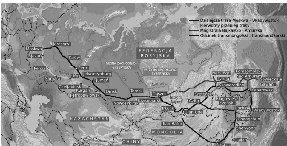
Figure 1. The route of The Trans-Siberian Railway

container (TEU) container. Much more favorable is the price of sea freight which for one TEU container varies from 1100 USD to about 1990 USD for one TEU container (Pluciński, 2013; Grzybowski, 2015). Another disadvantage of the Trans-Siberian Railway is the necessity of reloading containers and other cargo at border stations with the change of track gauge from 1524 mm to 1435 mm. The idea of using variable gauge system (for instance SUW 2000 type, developed by Ryszard Suwalski) is more applicable to passenger transport. However, the current transshipment potential of Polish and Belarusian railways on the eastern border of Poland is sufficient. Małaszewicze, Brest, Sławków and other border railway stations are fully prepared for the efficient and rapid reloading of containers for standard gauge platforms and for comprehensive cargo handling in the connections of Europe and East Asia.