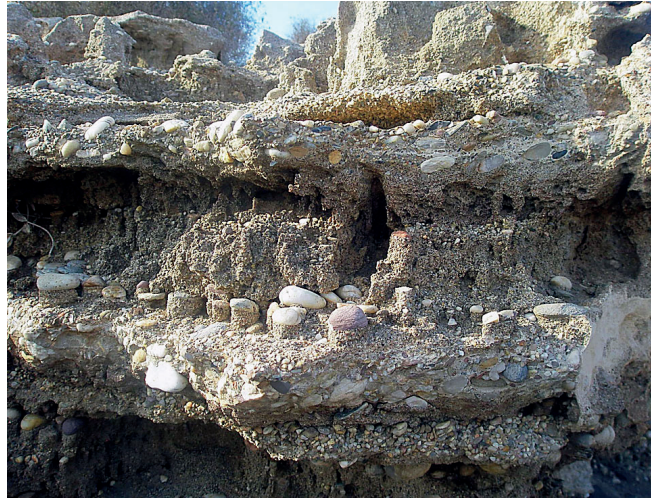
Fig. 5. The example of fractional sedimentation of clastic deposits with clear levels of pebbles, gravels and coarse sand

The final phase of the volcanic process is the migration of the hot, post-magmatic liquids in the fissures of rocks that surround the cooling magma tank. Just after the Rodalquilar caldera had collapsed, it was filled with volcanic and pyroclastic rocks (Fig. 4) and products of hydrothermal activity of the hot liquids which has started as a result of some local transformations and impregnations of different types of minerals. Numerous cracks and fissures in rhyolites, rhyodacites and ignimbrites are filled in their upper parts with clay and silica materials. Meanwhile in their lower parts, it is possible to identify ore minerals, first oxides and then sulphates.