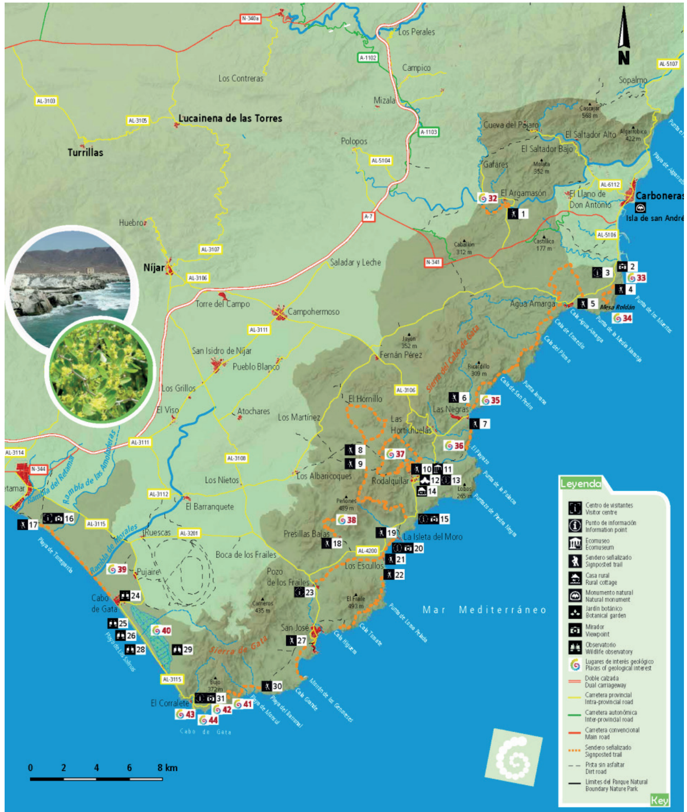
Fig. 1. Location of the Cabo de Gata-Níjar Geopark in southern Spain (www1)

Gata-Níjar is a unique example of the volcanic activity in the world, which has been preserved in excellent conditions. This study demonstrates the high values of that area, and considers future dilemmas as well as management strategies.