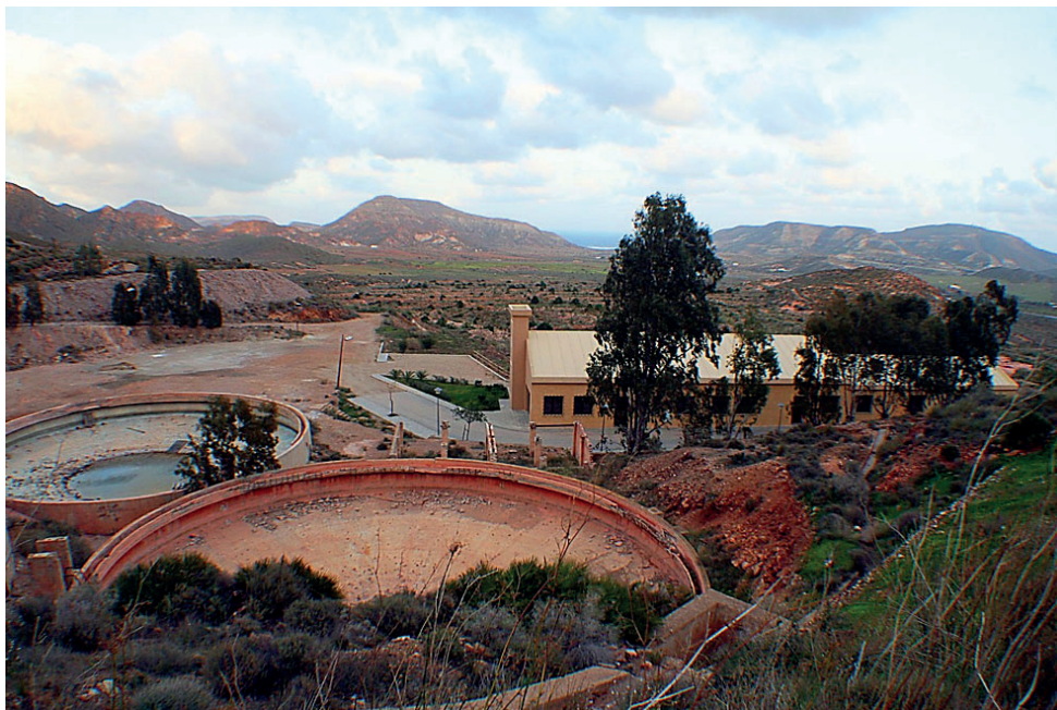
Fig. 7. The remains of the Rodalquilar gold mine: circular in shape cleaning tanks for mixture of minerals and cyanide; interpretation center to the right

One of the most significant cultural aspects is related to the mining activity that started to be developed in this region in the 14 th century. The most important period for the mining is related to the 19 th century, when some quartz and galena veins were discovered. Lead and silver, and less copper and tin, were mined here until the late 20 th century. From that time, a dark period started for the mining industry in the Almería Province. Nonetheless, the discovery of gold had changed the bad luck in the region rapidly and led to swift economic and social growth. The gold was mined until the late 19 th century, with deep shaft mining and until 20 th century, with surface mining. The most important gold mine in the area was the Rodalquilar gold mine, which was closed in 1966 (Feixas, 2003; Villalobos Megía et al. , 2007). Its remains occupied quite a large area and they are significant tourist attraction, although not fully prepared for tourism (Fig. 7).