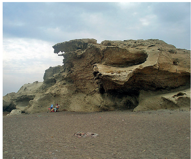
Fig. 8. Example of eolic erosion forms in the Upper Miocene shallow-marine organogenic limestones

However, as Cabo de Gata-Níjar is one of the most famous destination for the national and world tourists, the geotourism is still not that popular. People mostly come here because of the great climate during most parts of the year, outstanding beaches and interesting landscape forms (Fig. 8). Are they really able to appreciate its geological importance and richness? Are they aware of its uniqueness?