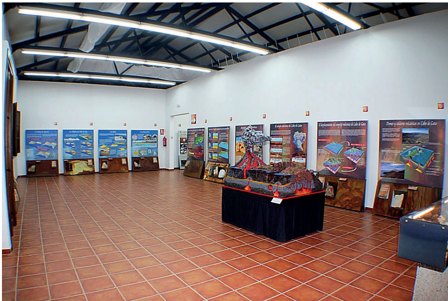
Fig. 9. The House of Volcano, interpretation center with a model of volcano and panels showing regional geology and ca. 2,000 years of mining history in the Cabo de Gata-Níjar

All future actions that will be taken in the frame of the geopark's management are centred in the sustainable development strategies. In other words, there should be an assured balance between protection and economic progress. The local government has established some important goals that should be completed in the long term plan. It contemplates the increase in the local productivity with evaluation of the natural and cultural aspects of the park. Tourism is still one of the most important factors for the local economy that should be strictly regulated. Its continuous growth might be both, beneficial and harmful. Nonetheless, the control of this activity seems to be on the right level at the moment. Some actions to be taken to promote scientific investigation and local society involvement.