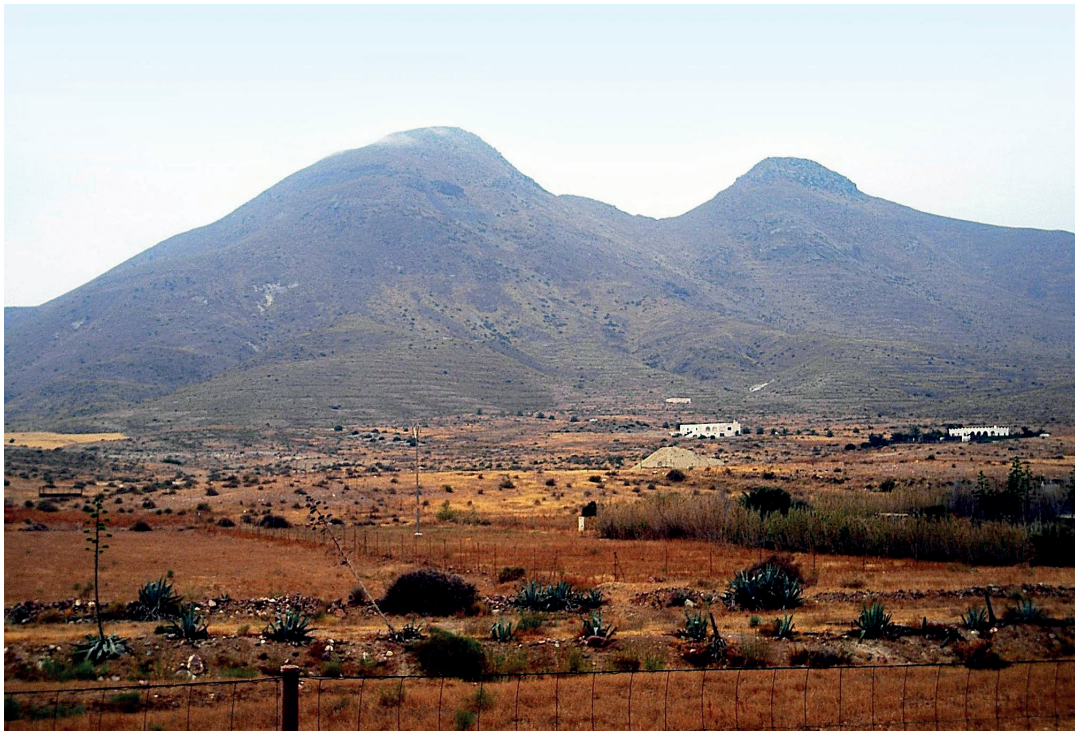
Fig. 3. Cone of the Los Frailes volcano built of ignimbrite which origin was related to the collapse of a huge Rodalquilar caldera