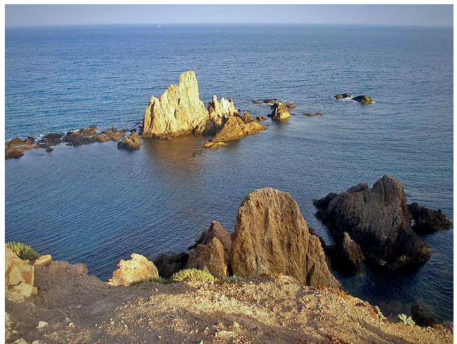
Fig. 6. Andesitic rocks partially submerged in the sea are the remains of a volcanic chimney after collapse of the caldera

Almería Bay. One of the most important aspects to determine the zones were the complex geological processes caused by the collision of tectonic plates and lava outflow. The main part of these remains is submerged recently by the sea, but there are still some important formations that stand out at the surface or are partially submerged (Fig. 6). The Cabo de Gata Mountains reaching 493 meters above sea level are among the most important examples of volcanic activity in the Iberian Peninsula. On the contrary, the Almería Bay provides some outstanding beaches formed by fossils like the Strombus bubonius . Both ones are situated close one to another, provoking an interesting contrast and numerous examples of tiny islets, which produce an extensive marine archipelago of volcanic domes (Díaz Álvarez, 1983).