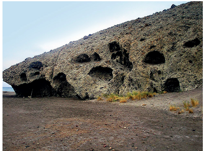
Fig. 2. Example of the ignimbrite lava flow intensely eroded by wind and see

interesting forms (Fig. 2). Sometimes, the outline of the hills is irregular. These irregularities can be perceived in the central parts of the calderas. Their formation might be provoked by two possible reasons: (1) strong eruption that blows up the upper part of the cone, or (2) the collapse of the half empty chamber after explosion. Frequently, another eruption creates a new smaller cone inside of the caldera that can collapse as a result of subsidence (Fig. 3). The eruption of the volcano located near Rodalquilar was especially spectacular. Inside of the earlier caldera with size 4 \times 8 km, a smaller one was created with 2 kilometers of diameter. This process and its evolution were described by Rytuba et al. (1990) and Labus (2009).