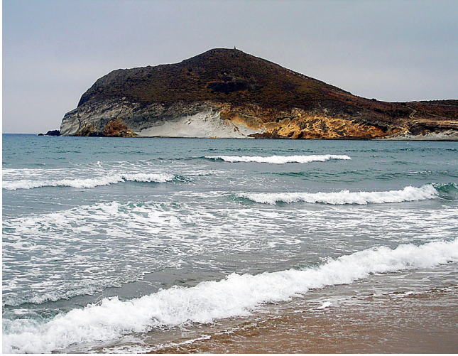
Fig. 4. The level of white ignimbrites is covered from the top by andesite lava flow