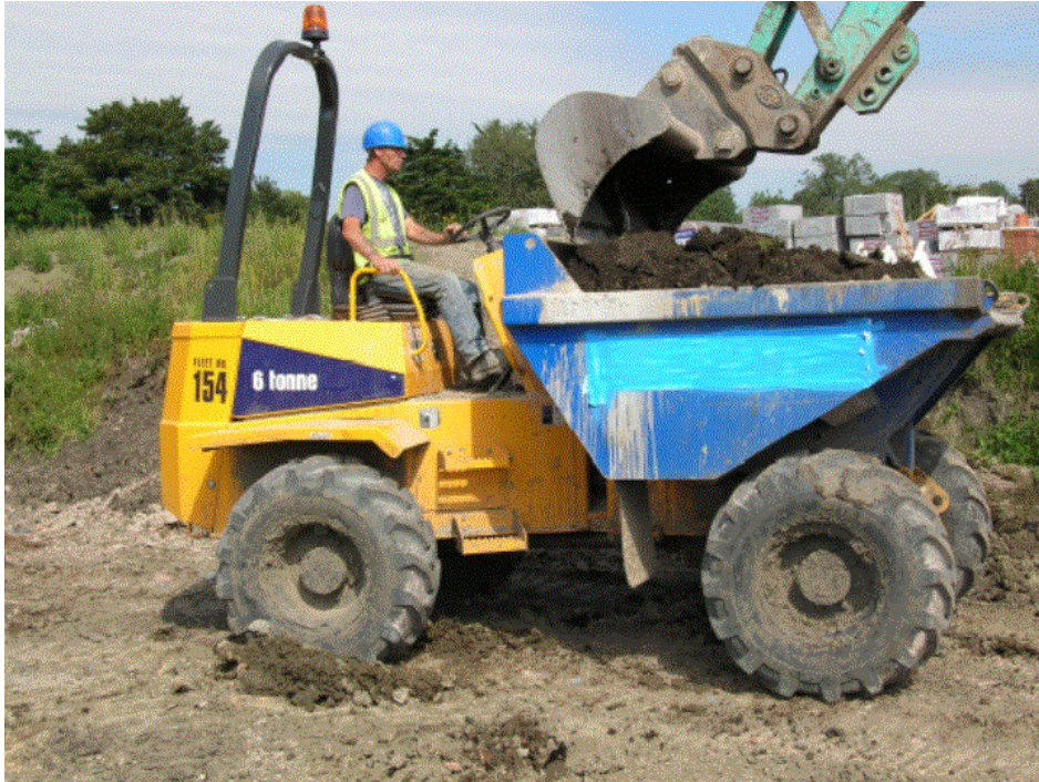
Figure 1. Example of stimulus material: sitting in the seat while the dumper is being loaded by an excavator.