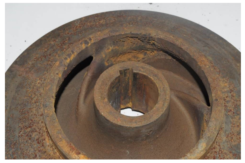
Fig. 2. Centrifugal impeller with a single curvature of the blades. Cavitation damage: rear wall of the blade near the edge of the inlet, cast iron [3]