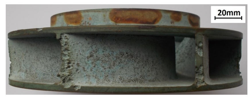
Fig. 4. Centrifugal impeller with a single curvature of the blades. Cavitation wear of the inlet edges of the impeller blades, silicon bronze [17]