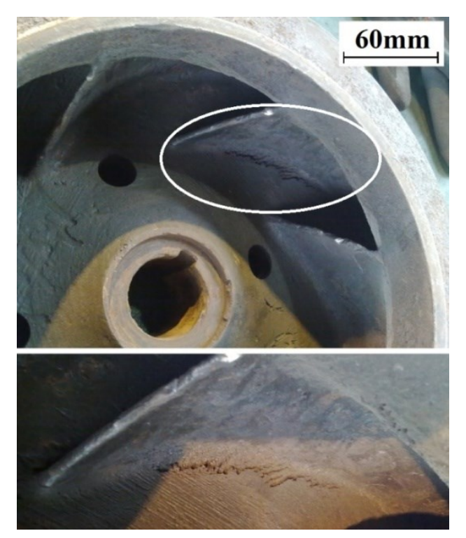
Fig. 3. Cavitation damage of the rotor disk located near the intake edge of the blades. The magnified area shows a typical, rough surface area of cavitation erosion [16]