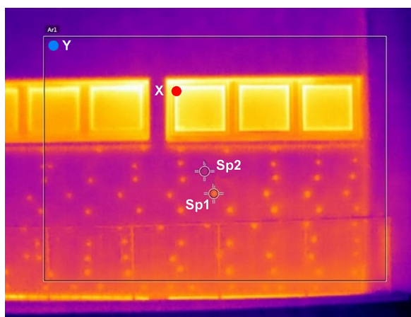
Fig. 2. Spot thermal bridges caused in fixing foamed polystyrene panels for facades

Figure 2 presents the results a of heat transfer study through a section of the insulated exterior wall of the building. The two indicated spots are marked as Sp1 and Sp2. Sp1 temperature is 6.6°C and at point Sp2 it is only 4.9°C. The measurement result of the temperature at point Sp2 represents the range of the surface temperature marked in lower spectrum (pink colors range) of the available palette. While point Sp1 is a place in