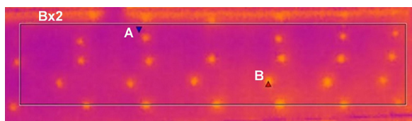
Fig. 3. Distribution of temperature on the wall in the area Bx2

which the guide pin fix the thermal insulation and makes a thermal bridge. This situation is unacceptable in energy-efficient buildings and passive ones. In the picture (Fig. 2) the caused thermal bridges around the window frame are clearly visible. The temperature difference between point X (red) of 12.2^{\circ}\text{C} and point Y (blue) of 3.8^{\circ}\text{C} is 8.4^{\circ}\text{C} . It is distinctly visible that the poor design, selection and installation can lead to quite substantial heat losses.