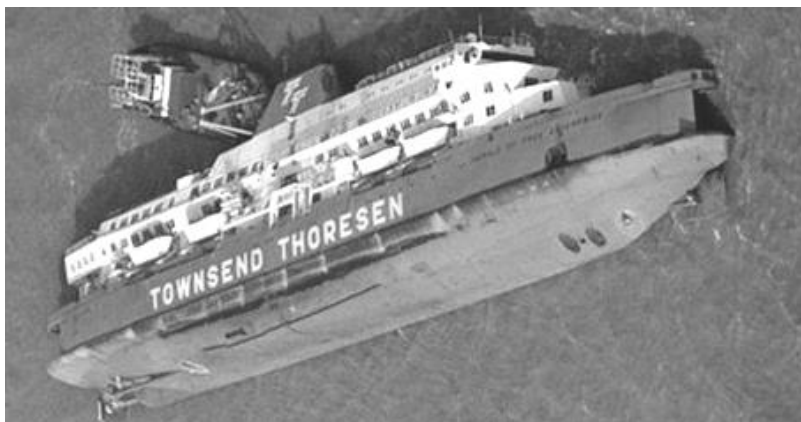
Fig. 5. The wreck of MF 'Herald of Free Enterprise'

After the accident IMO begun works on the International Management Code for the Safe Operation of Ships and Pollution Prevention and several improvements