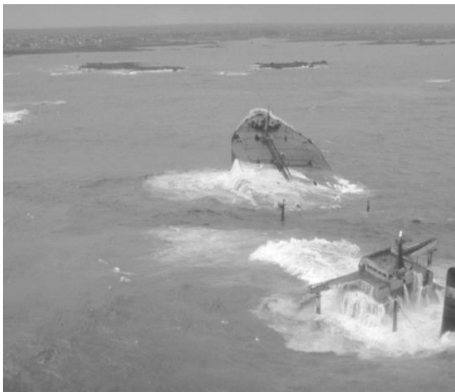
Fig. 4. Sinking 'Amoco Cadiz'