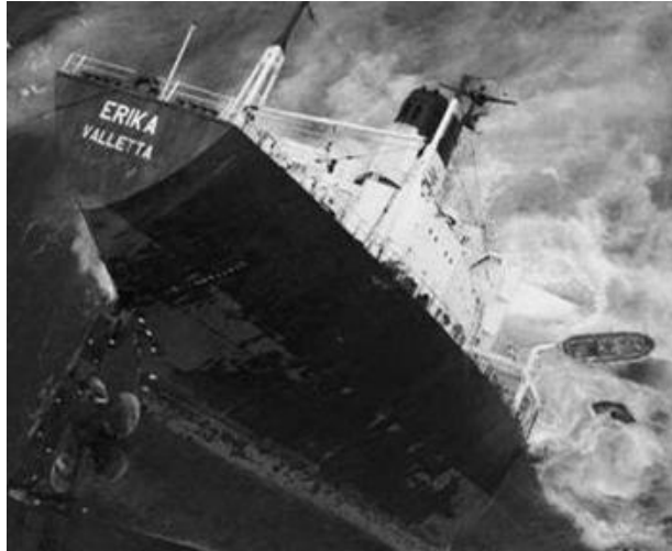
Fig. 6. Sinking tanker 'Erika'

In response to the disaster of tanker 'Erika' IMO had decided that from 1996 only double hull oil tankers should be constructed and existing single hull tankers shall be replaced by double hulls till 2026. Baltic countries agreed and signed on 10 September 2001 Declaration on the safety of navigation and emergency capability in the Baltic Sea area (HELCOM Copenhagen Declaration). European Union, reacting on disasters of 'Erika' and 'Prestige' (described in the next chapter), adopted, to improve safety standards in maritime transport, three legislative packages known as 'Erika I', 'Erika II' and 'Erika III'.