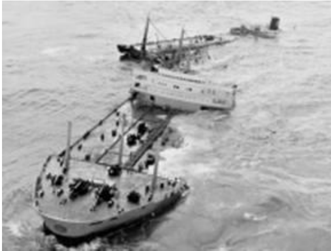
Fig. 3. Broken into two parts tanker "Torrey Canyon" [ home.bt.com/news/world-news/march-18-1967-environmental-disaster-feared-as-tanker-torrey-canyon-hits-rocks-off-cornwall-11363968852975 (access 17.05.2017)]