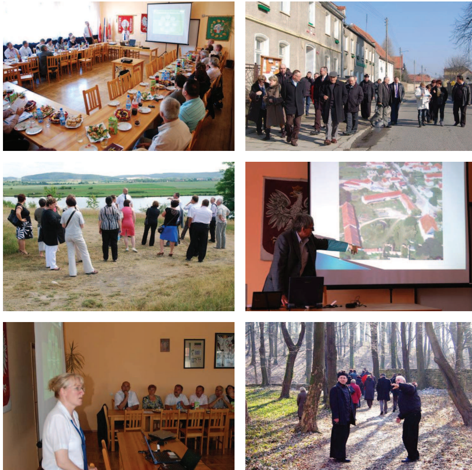
Phot. M. Brożek 2011

the investment of this size. Good preparation of the report and plan will be crucial for obtaining an external investor.