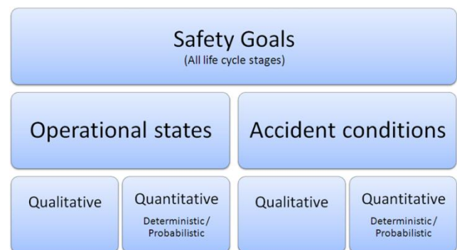
Figure 1. Basic types of safety goals

The resulting spectrum of safety goals is illustrated in Figure 1 .