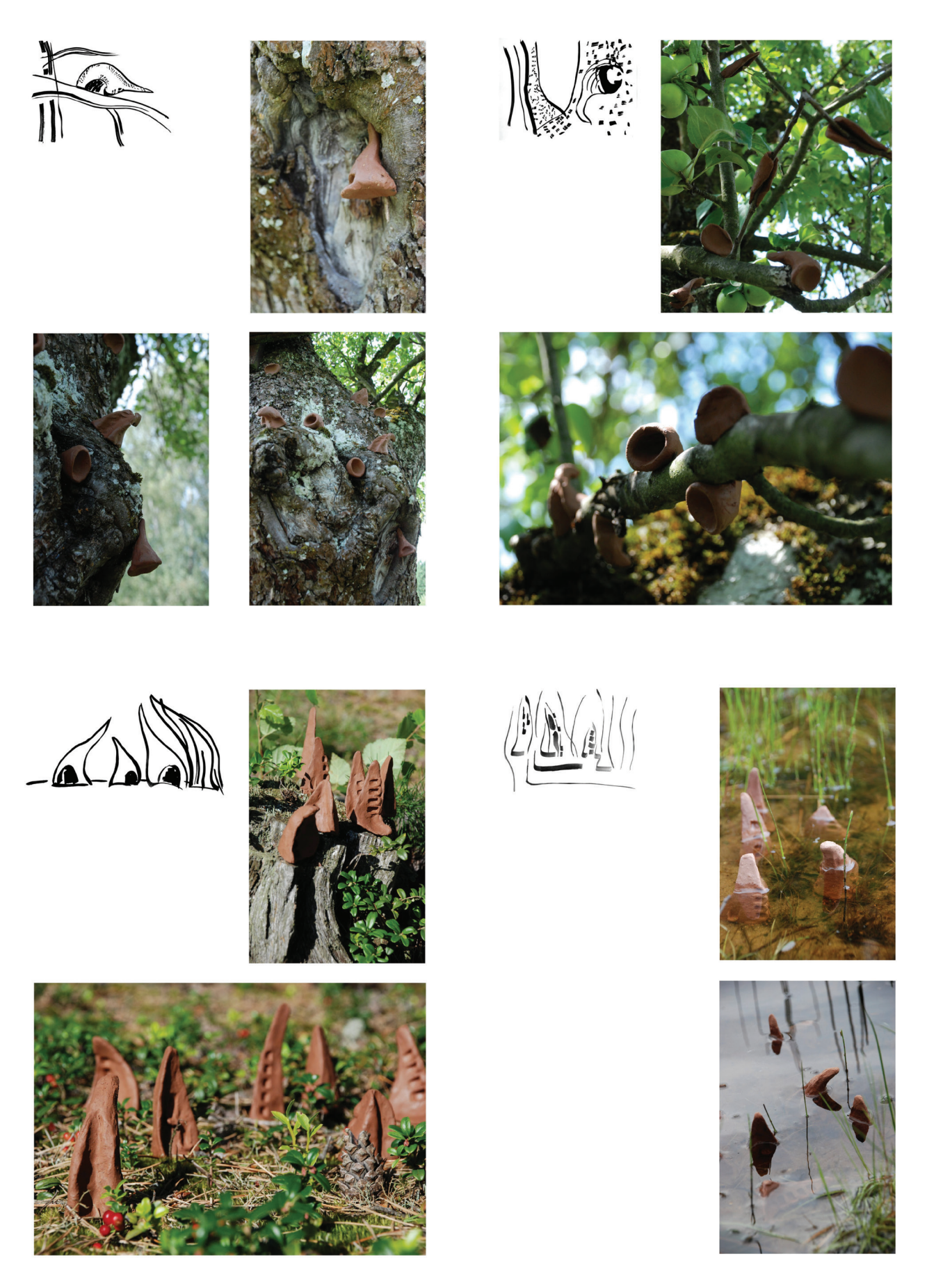
Fig. 2. Selected activities as part of the author's original project entitled "Kashubian residence. In search of bionic relations". Schelters (elaborated by A. Kurkowska)