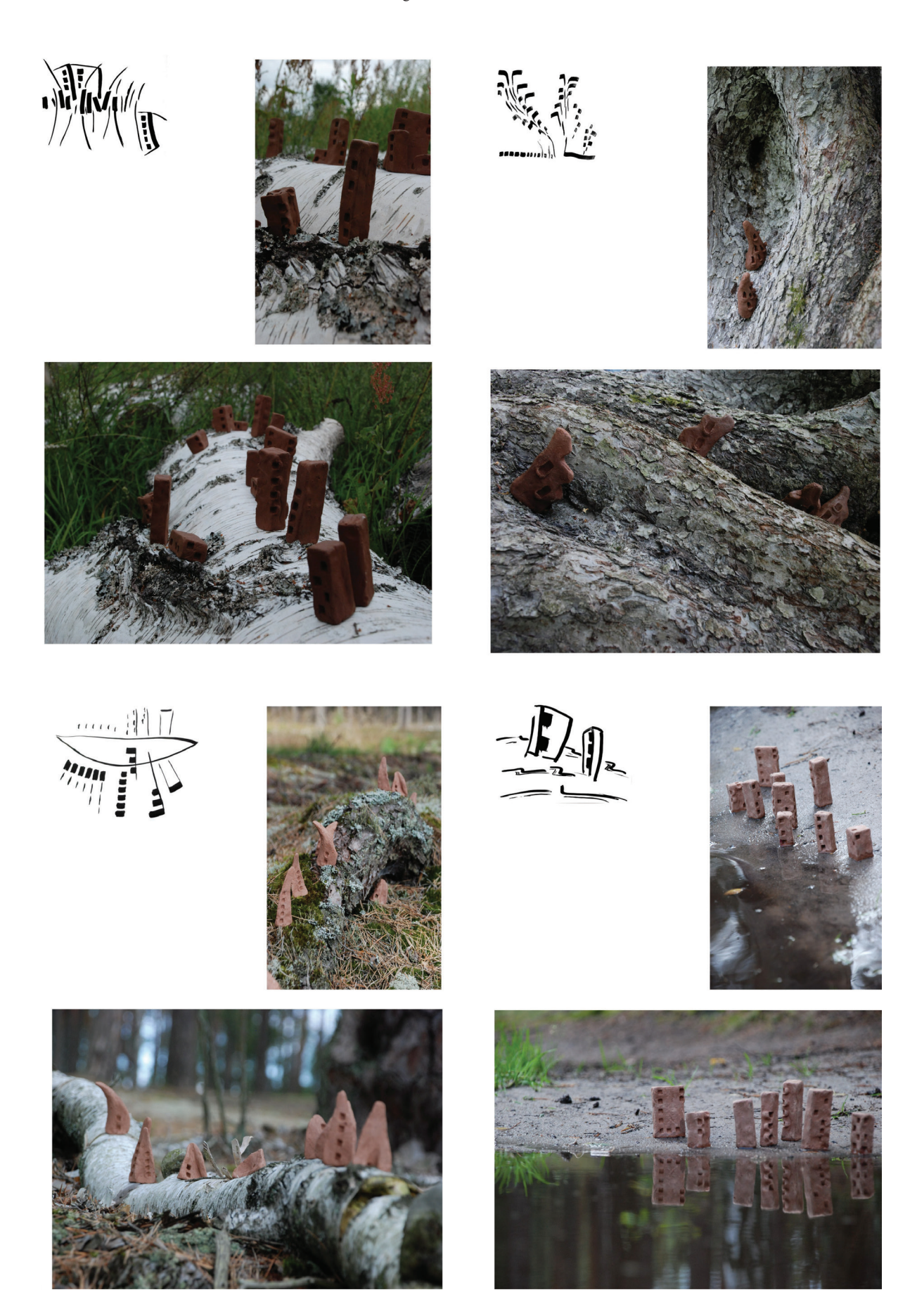
Fig. 3. Selected activities as part of the author's project entitled "Kashubian residence. In search for bionic relations". Sets of repeating elements (elaborated by A. Kurkowska)