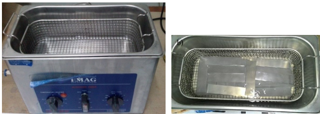
Fig. 1 Degreasing in a bath of acetone under laboratory conditions