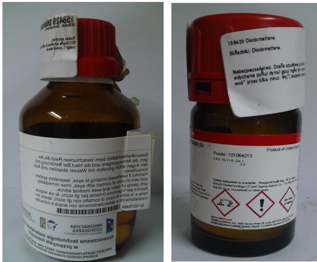
Fig. 3 Examples of markings for measuring liquids (diidomethane)

A careful analysis of composition of the chemicals that are used in bonding, makes it possible to apply appropriate practices. On the label of adhesives can be found information about impact on the environment (Fig. 3 and Fig. 4).