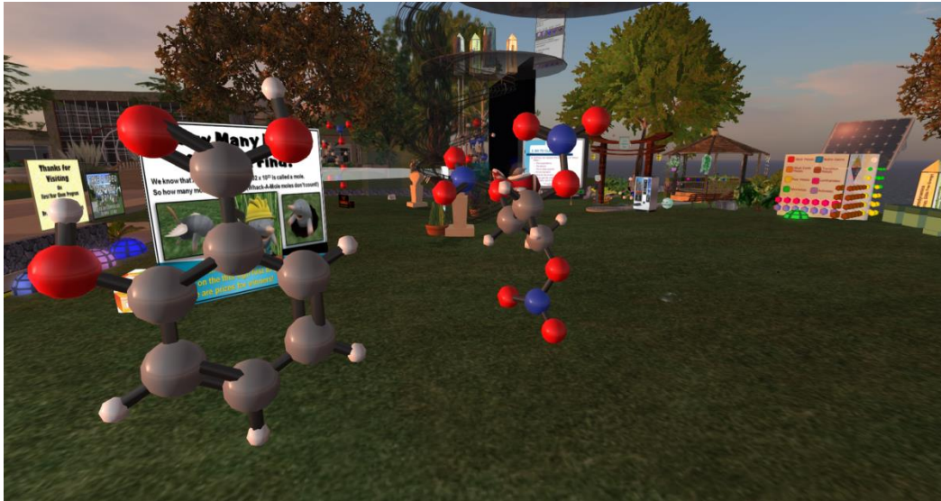
Fig. 2. 3D presentation of Content in VLE