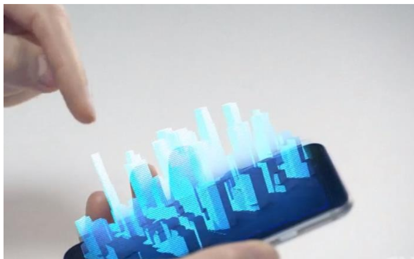
Fig. 3. Innovative holographic technology - LEIA 3D

century. This new display is transforming a technology that's been around for 100 years 39 .