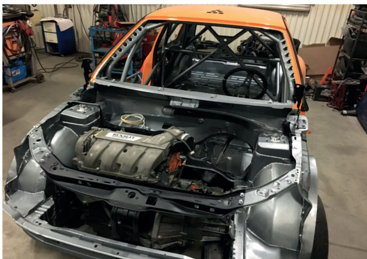
Fig. 4. Engine and gearbox assembly installed in the car body

Following the selection of an appropriate engine, the engine was subjected to modifications. The modifications were made to components of the piston-crank mechanism, valve gear, induction and exhaust systems, and electronic control system. The modifications resulted in satisfactory effects; however, a safety margin was left to the values at which the engine failure rate might dramatically increase [3].