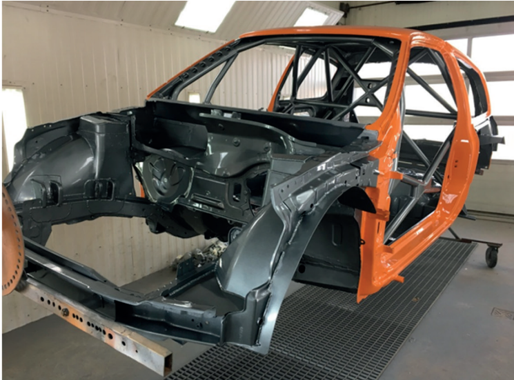
Fig. 3. Car body prepared for the installation of subassemblies