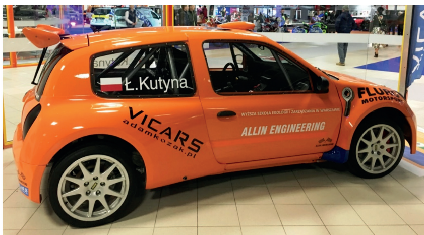
Fig. 8. Finished vehicle officially presented at the Warsaw Moto Show 2017

The last of the factors that defined the direction of works was the facilitation of servicing the car. Every vehicle component, from individual parts to complete assemblies, was so designed, mounted, or used as to minimize the time needed for its adjustment, repair, or replacement. Thanks to this, possible defects can be quickly diagnosed and rectified. This is the best point of this construction. Thus, all the basic requirements adopted before starting the work have been met.