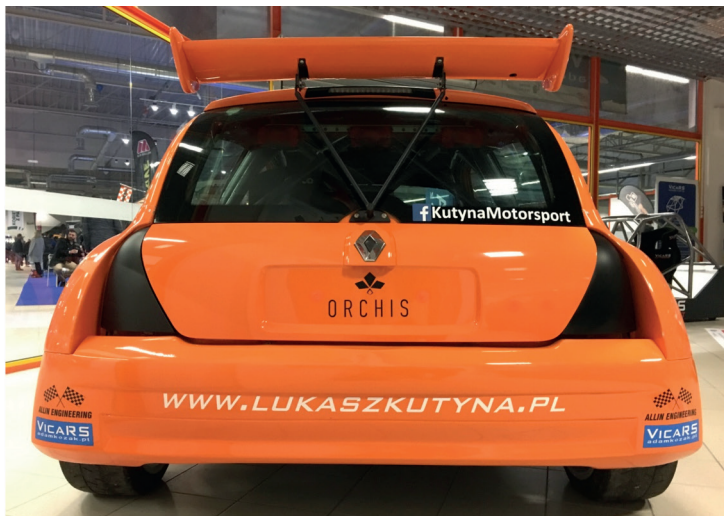
Fig. 9. The car body has been significantly widened