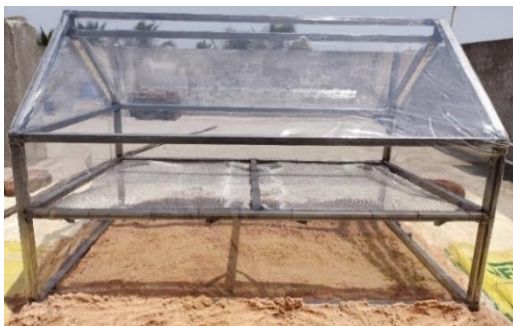
Fig. 1. Experimental Setup of Solar greenhouse dryer

The drying tray provided for SGHD was inclined to the base surface to maximize the inclined solar radiation onto the dryer. The two-air inlet was provided along with the upper duct section for a free passage of air into the Solar Greenhouse Dryer. The drying tray is provided with a fine wire mesh for drying the agricultural yield. The North wall of the Solar Greenhouse Dryer was insulated to avoid heat loss during the drying process [11]. The drying process was performed using free convection, as in many rural areas there is load-shedding due to which electricity cannot be effectively used for the drying phenomenon [12]. The actual experimental setup with the north wall insulation is as shown in the Figure 1.