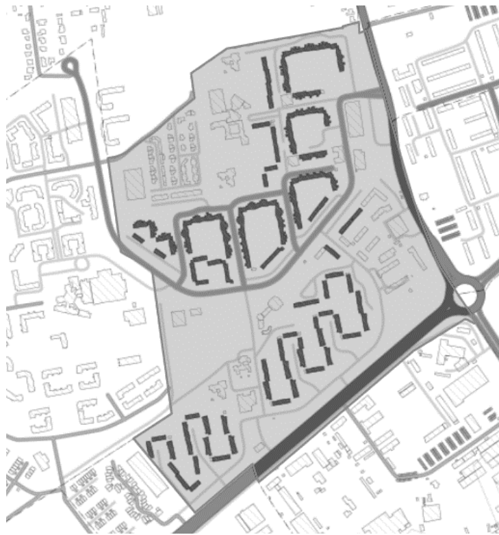
Legend: ■ research area ■ multi-family buildings built in 1980–1991 ■ national road ■ commune road ■ other road Figure 2. Research area.

The research area is a single cadastral district of the city of Kalisz, marked with number 0073 (Dobrzec housing estate), covering the area of over 63 hectares (fig. 2).