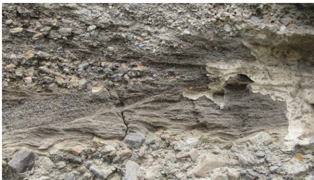
Photo 2. Changes in the sedimentation environment reflected in the different size of the sediments deposited. A washout on the left wall of the Taltura River valley

(from 0.3 – 4 to 5 m) are formed. Some of them are visible in satellite images. The emergence of the destructive flow occurs due to the merging of small creeks, traces of which are hardly visible after they dry out. On the slopes built by friable or disturbed by human activities, earthquake etc. deposits, where these creeks join, a big washout is formed [AGADZHANYAN et al. 2006]. In the walls of such washouts, the composition of ice-borne sediments and features of the friable deposits structure, their thickness, and their ratio to bedding rocks of the valley slopes are available to studying (see Photo 2).