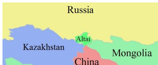
Fig. 1. Location of the Altai Republic; source: http://kostya-sergin.narod.ru/pohod/pohod2009/asia2009/map/map-yandex-m.jpg with authors' refinement

The Altai Republic is situated in the southeast of Western Siberia. It has external borders with Mongolia, China, and Kazakhstan (Fig. 1) and internal borders with the