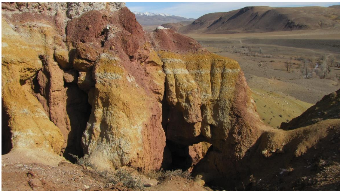
Photo 1. A washout in the red Devonian deposits

Recent exposures allow for the observation of the results of relief-forming processes that occurred in the past. For example, the earthquake of 2003 induced a huge landslide. Today, one can see traces of solifluction in the cliffs formed on the landslide boundaries (see Fig. 3).