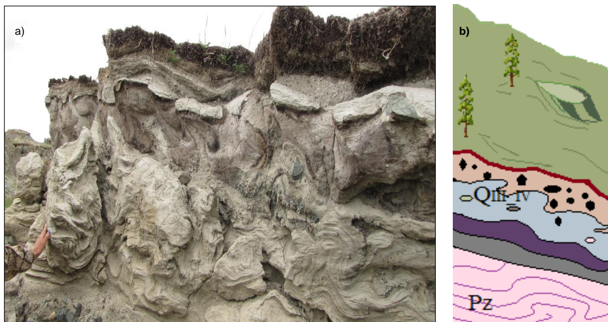
Fig. 3. A landslide formed by the earthquake of 2003 on the right wall of the Taltura River valley: a) argillaceous deposits with flow lines under the soil (photo N.A. Kocheeva ), b) scheme of deposits; QIII–IV = quaternary deposits, Pz = the Paleozoic deposits; source: compiled by N.A. Kocheeva

The Chagan River basin is one of the most interesting sites of the geopark Altai for observing the current dynamics of its relief. The left and the right valley walls significantly differ in their dominating landscapes. In particular, the left wall of the Taltura River valley to the mouth of the Dzhelo River is almost deprived of vegetation, which is the reason for the predominance of semiarid landscapes. Here landslide and mudflow phenomena prevail. The right wall is better sodded, causing the spread of steppe landscapes at the foot of the slopes and larch forests in their middle parts. Thus, in the complex of relief-forming processes predominate those that are characterized by a smaller contrast, a longer duration, and a greater aesthetic attractiveness.