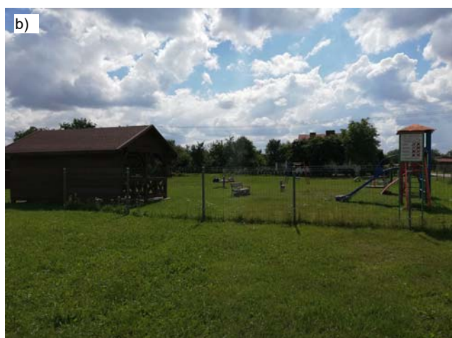
Photo 1. Investments in Szyleny: a) water and sewage project, b) playground and recreational shelter