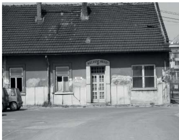
Ryc. 3. Sztygarówka