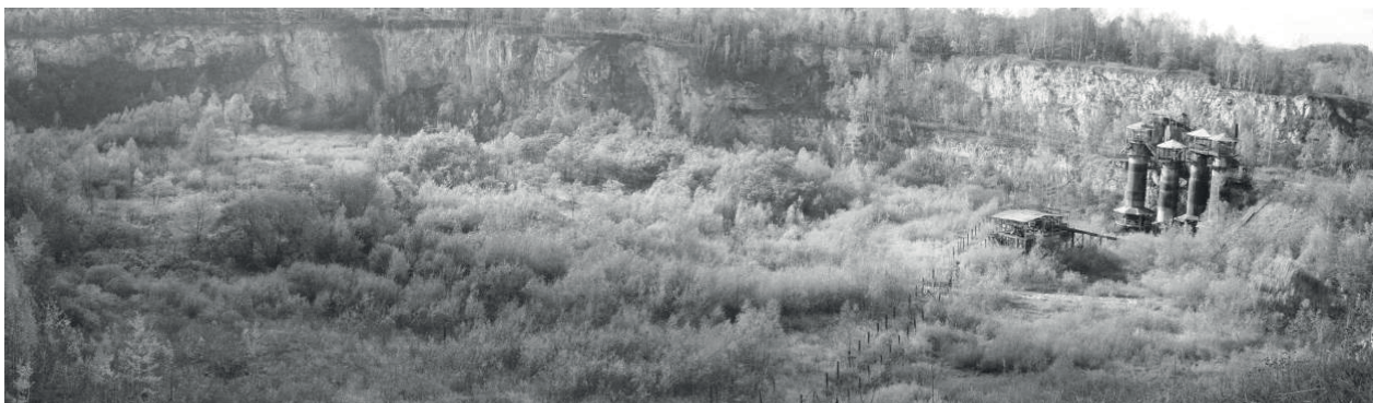
Fig. 1. of the “Liban” quarry from the Krakus Mound

Ryc. 10. Widok na kamieniołom „Liban” z Kopca Krakusa