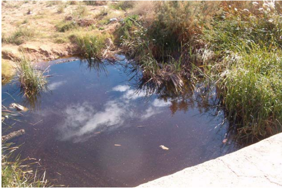
Phot. 3. Discharge of waste water into the bed of the wadi downstream Ahbass Ajdid