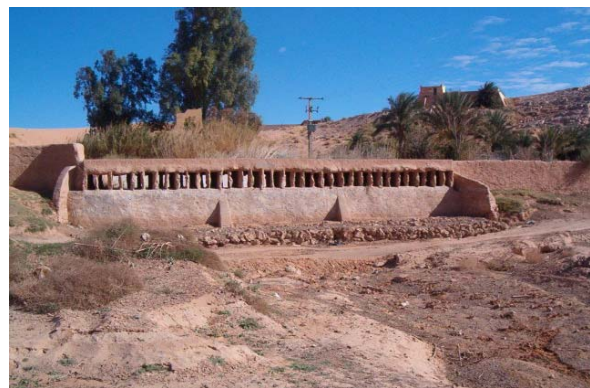
Phot. 8. Water outlet at Bouchène dam