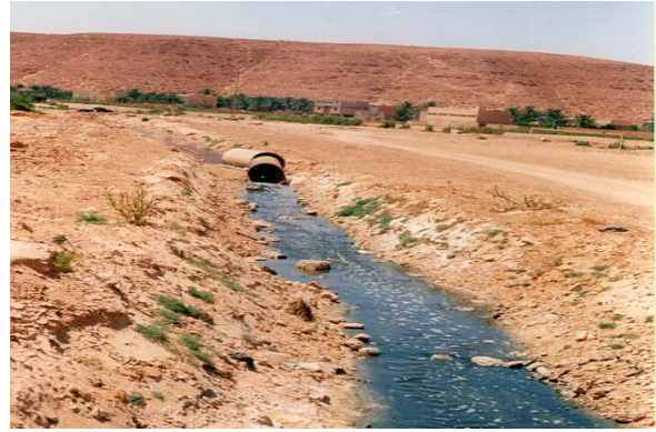
Phot. 4. Bloodletting in the bed of the river of M'zab El Atteufto channel waste water