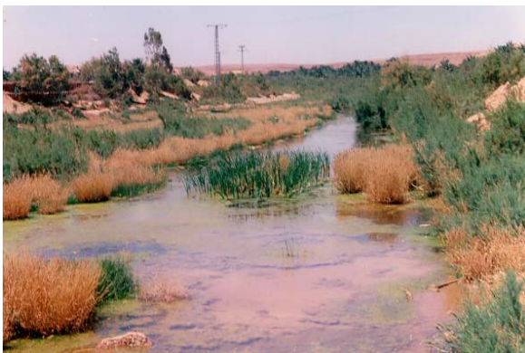
Phot. 5. Wastewater into the bed of the river, downstream of the wastewater treatment plant