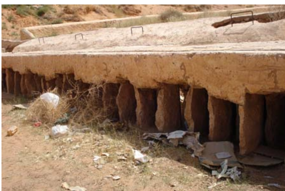
Phot. 9. Sharing system floodwaters