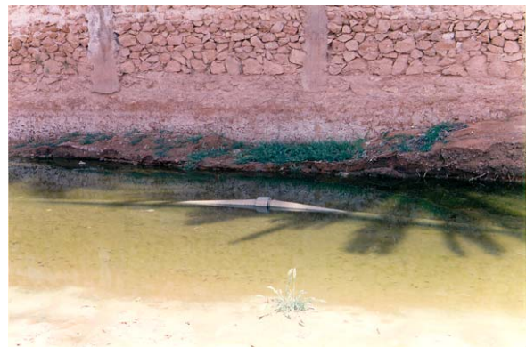
Phot. 6. Conduct of drinking water through the air zone sewage stagnation