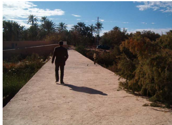
Phot. 1. Dam of Ahbas Ajdid

This is the dam the most emblematic of the M'zab valley. The dam is to cross the wadi, is based on the slope on the right bank. The dam has a spillway and a topographical closure consists of a stepped embankment on a masonry wall (Phot. 2). The main dam has suffered a major breach after the flood of 2008. Repairs and reinforcement has been made to restore its integrity. The El Atteuf dam is the last structure of M'zab River. It plays a very