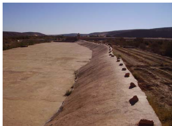
Phot. 2. El Atteuf dam