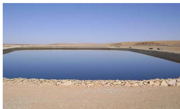
Phot. 10. A view of the water treatment plant by lagoons the M'zab Valley