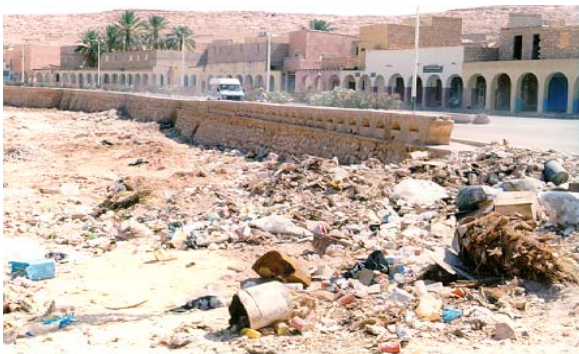
Phot. 7. Wild discharge zone in the bed of the wadi in Ghardaia