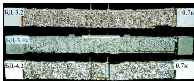
Fig. 4. The overall view of the beam after testing (KHMIL R.Y. 2003)

The overall view same specimens after testing are presented on Fig. 4, 5.