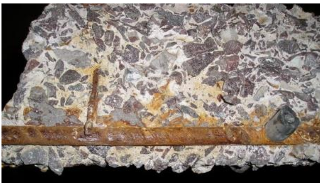
Fig. 6. The overall view of the armature corrosion:

a) a small corrosion intensity; b) a bigger corrosion intensity