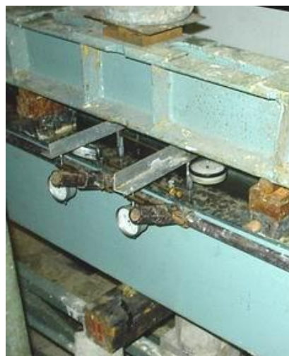
Fig. 3. Gauges position on of the beam during testing.

The deformations of concrete, armature and beams' deflections have been measured by gauges (Fig. 3).