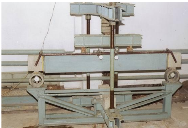
Fig. 1. The overall view of the beam during testing Sources: (KHMIL R.Y. 2003)

facts, experimental researches was carried out within the laboratory work with the general amount of 22 reinforced concrete beams which were under the simultaneous influence of loading and aggressive environment (KHMIL R.Y. 2003, VASHKEVYCH R.V. 2005). Reinforced concrete beams were under the loading 0,3; 0,5; 0,7 from the limit load which corresponded to the maximal bearing capacity of beams. 10% sulfuric acid solution ( H_2SO_4 ) has been used as an aggressive environment which has been placed in special containers of attached above beams. The loading has been applied in the third part of the beams' span in the form of two focused forces (Fig. 1, 2).