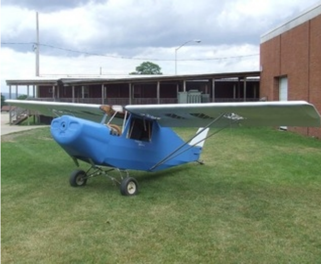
Fig. 2. Experimental aircraft designed and built by students

The prototypes for both projects are shown in Fig. 2 and Fig. 3.