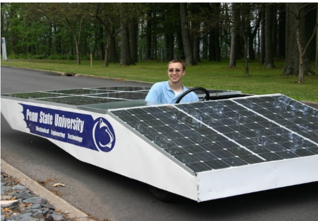
Fig. 3. Solar-powered car designed and built by students