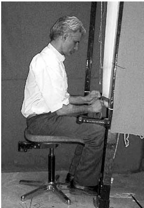
Figure 3. A prototype of the designed loom and workstation. Legs are well supported. There is enough clearance under the loom for legs. The overall body posture is neutral.

With regards to the developed guidelines and after a thorough study on the looms currently being used in weaving workshops, a loom and a weaving workstation prototype were designed and constructed (Figure 3). The most important feature of the workstation is its adjustability. The loom is vertical. The height of the loom and the seat is adjustable so that weavers can adjust weaving height (work level) according to their preferences.