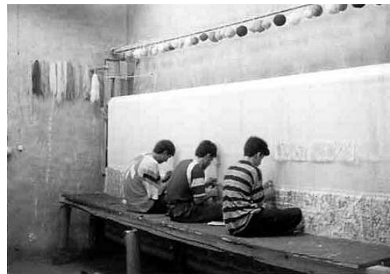
Figure 1. Weavers are weaving at a vertical loom. They are sitting on a piece of lumber in a cross-legged position.

An assessment of the weavers' work showed that a high percentage of observed postures of the upper arm, neck and trunk deviated from the neutral posture (Table 3). In 70.3% of all cases, leg posture obtained a score of 2 indicating that weavers sat on the ground or on a piece of lumber in a cross-legged or folded-knee position (Figures 1 and 2). Working posture assessment indicated