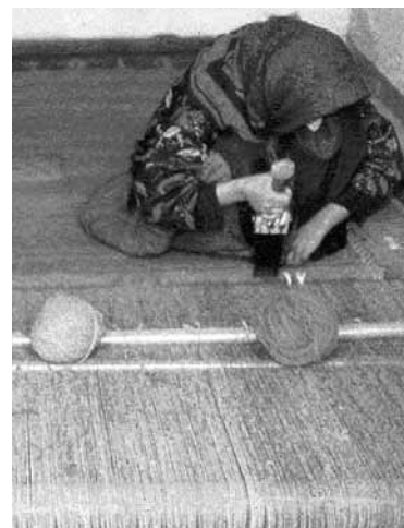
Figure 2. A woman is working at a horizontal loom. The back is bent excessively; her knees are folded and the overall body posture dramatically deviates from the neutral.