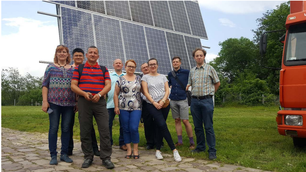
Photo. 1. Project Partners during a visit in Center for Sustainable Development and Energy Efficiency of the Faculty of Geology, Geophysics and Environment Protection, AGH University of Science and Technology in Miękinia