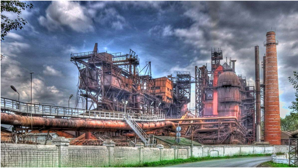
Fig. 2. Ilyich Iron and Steel Works (Mariupol, Ukraine)