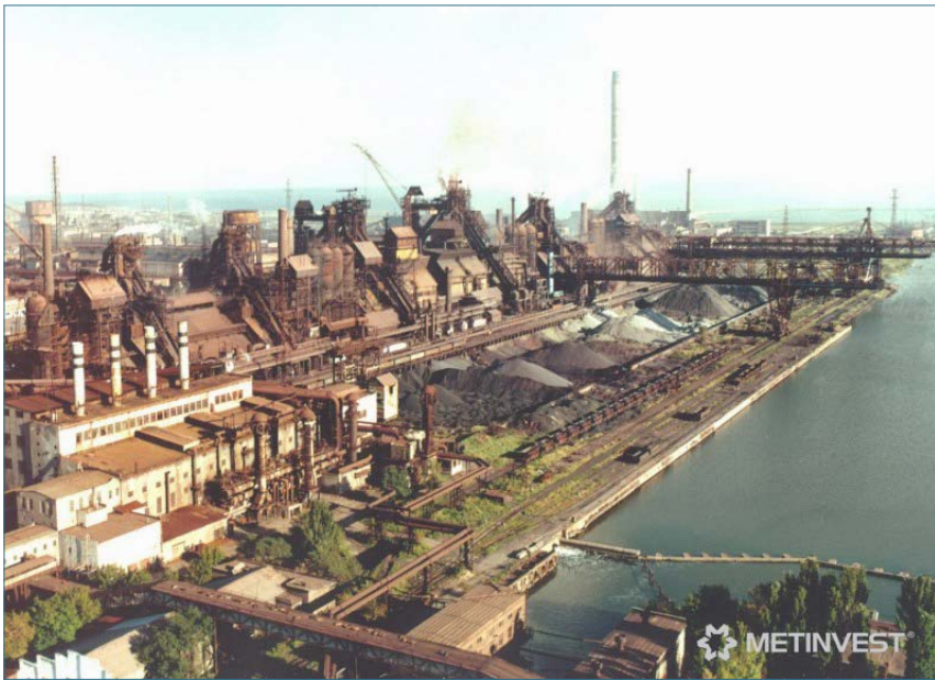
Fig. 1. Azovstal Iron & Steel Works (Mariupol, Ukraine)

Azovstal Iron & Steel Works (Fig. 1) is the only Ukrainian manufacturer of high-quality rolled products with a thickness of 6–200 mm and width of 1500–3200 mm for shipbuilding, power engineering and special machine production, bridge construction, large diameter pipe manufacturing for arctic main gas and oil pipelines and off-shore structures. The rolled products are subjected to 100% non-destructive ultrasonic testing. AZOVSTAL IRON & STEEL WORKS is the only enterprise where continuous production of ultra-high-strength steel X70 and X80 has been improved [2].