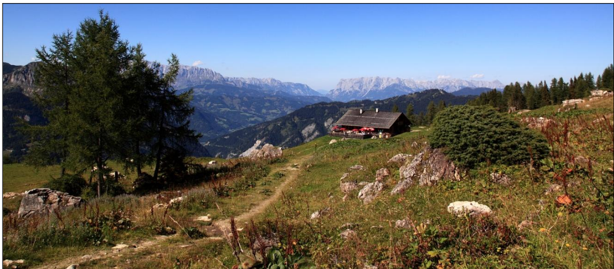
Fig. 4. A ‘typical’ high Alpine pasture landscape.

Text and image together present the landscape not merely as a physical agglomeration of peaks, meadows, huts and cows, but as an emotionally and aesthetically charged complex with a specific pattern. Other aspects of the Alpine pastures like roads, ski lifts and ski runs, the sometimes less enjoyable sights and scents of farming, or even the discomforts of romantic simplicity, are banished to the realm of non-hegemonic subdiscourse.