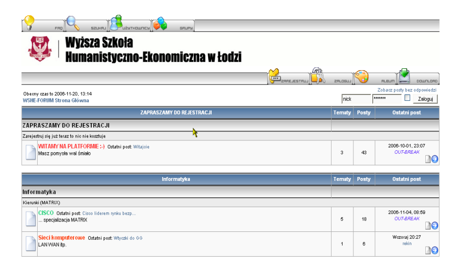
Figure 2. View of the e-learning tools

http://www.phpbb.com/. As mentioned on the web site [2] the phpBB is a high powered, fully scalable, and highly customizable Open Source bulletin board package. phpBB has a user-friendly interface (Fig. 2), simple and straightforward administration panel, and helpful FAQ. Based on the powerful PHP server language and (...) MySQL,/MSSQL/PostgreSQL or Access/ODBC database servers, phpBB is the ideal free community solution for all web sites.