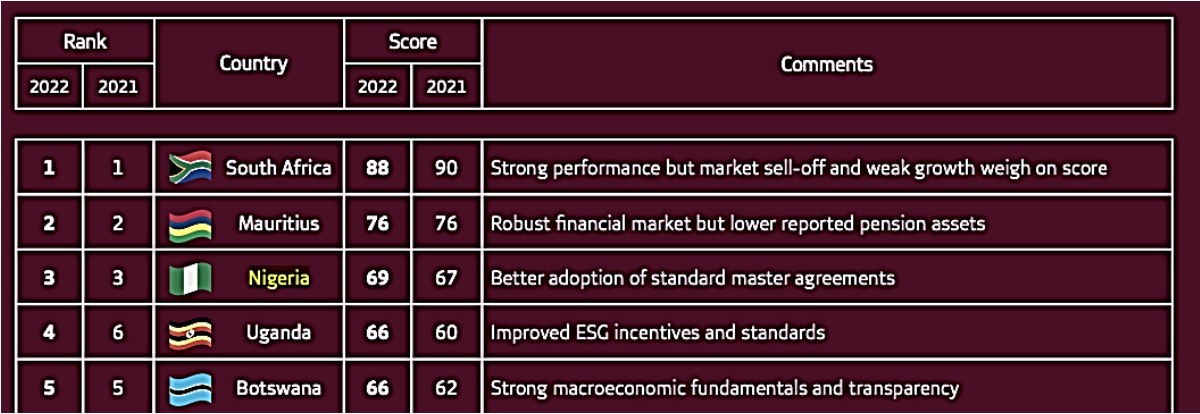
Figure 1. Absa Africa Financial Markets Index 2022. Harnessing the power of African opportunity.

The index assesses six strategic pillars, including market depth, access to foreign exchange, market transparency, tax and regulatory environment, capacity of local investors, macroeconomic opportunities, and enforceability of standard master agreements.