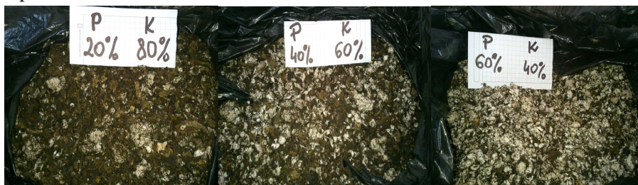
Photo. 3 Selected cellulose pulp (P) samples inoculated with compost (K)

During the studies, respirometric tests with various degrees of inoculation of the cellulose pulp with compost (40, 60, 70, 80, 90% of dry mass per sample) and tests for the compost (control tests) were performed. Two repetitions per each sample were made.