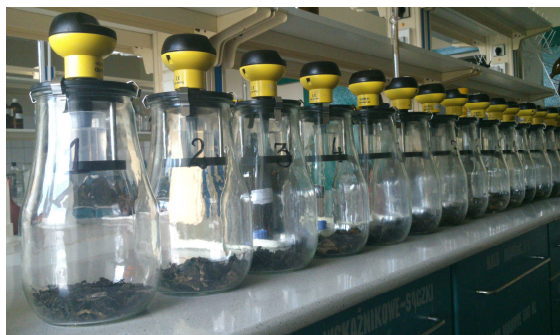
Photo 2. Oxi-Top set

The biological activity of the cellulose pulp was analysed using the AT 4 test. In order to carry out the respirometric test, a set including the OxiTop® OC 110 controller and MG 2.5 measuring vessels was used. The OxiTop apparatus consists of reaction vessels, adapters with fixing clamps and measuring heads. The stabilised material samples are placed in reaction vessels, which are closed tightly using an adapter with a measuring head fixed outside which contains an electronic vacuum pressure sensor. Inside each vessel, there is an attachment secured to the adapter, on which the CO 2 absorbent (photo 2) is placed. The measurement was performed at a temperature of 20±1°C for samples with a humidity ranging from 40 to 50%.