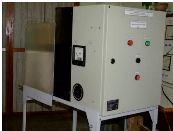
Fig. 1. Appearance settings for the processing of cereals in the electric field of high intensity

In recent years, at the Department of Electric and Electro Technology at the National University of Life and