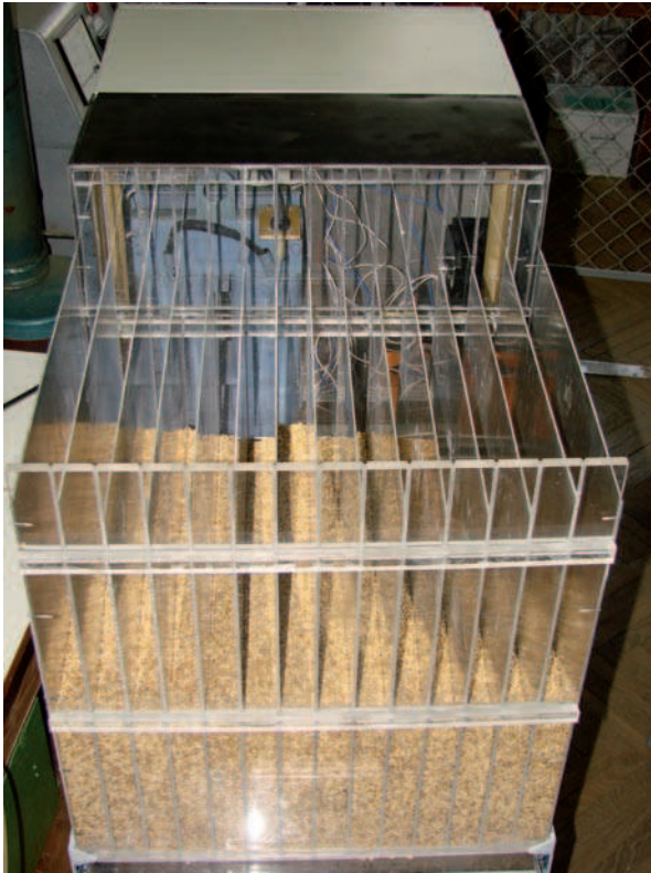
Fig. 2. Appearance of camera processing

At the developed installation the grain mass is poured into the processing chamber where it is between high voltage electrodes. The appearance of the treatment chamber is shown in Fig. 2.