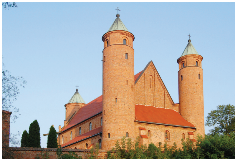
Fig. 7 Brochów, St Hohn the Baptist Basilica as of 2016.