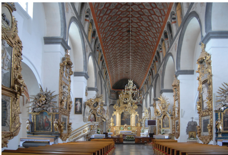
Fig. 3 Pułtusk, Collegiate Church of the Annunciation of the Blessed Virgin Mary, interior as of 2013.

original architectural solutions and rich painting decoration. Its most characteristic feature is the original 60 m long barrel vault stretching along the entire length of the nave and presbytery covered with unique painting decoration in terms of scale and content-ideological design. (Fig. 3) It is complemented with Renaissance, illusionistic frescoes inside the chapel built in 1553-1554 for bishop Andrzej Noskowski. The sixteenth-century polychromies preserved on the vault and in the chapel are the largest complex of Renaissance paintings in Poland and are perfectly preserved 12 . The collegiate church has been the subject of conservation works for a number of years.