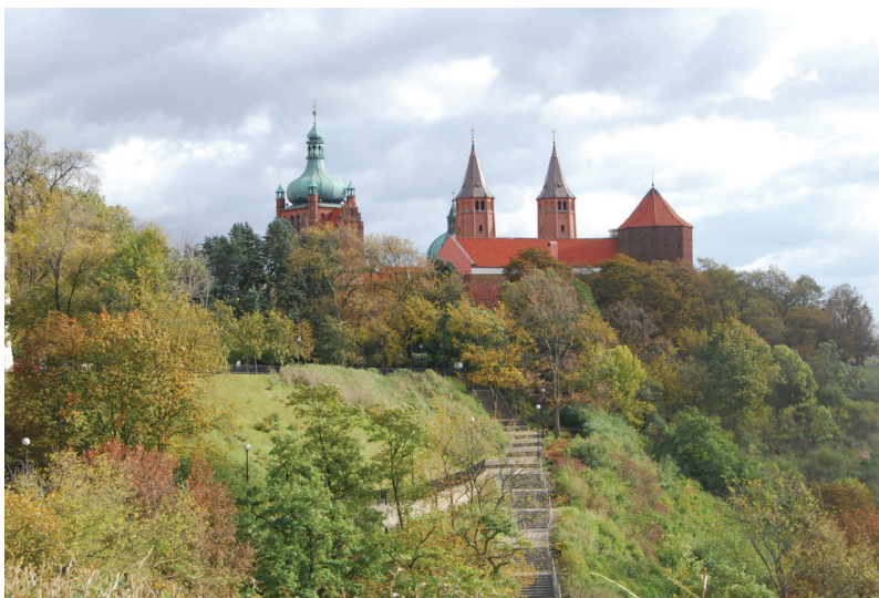
Fig. 2 Płock, Tumskie Hill, as of 2018 .

As stated in the justification, Płock is one of the oldest and most important urban centres in Poland, described in the 11th century by Gallus Anonymus as "sedes regni principalis", or centres where the rulers resided. During the reign of Władysław I Herman and his sons Zbigniew and Bolesław III the Wrymouthed, Płock became the main residence of the monarch in the country, at the same time the place of princely and church foundations, and the Płock Cathedral became the necropolis of sovereigns. After a period of feudal fragmentation following the Wrymouthed's last will, Płock remained the capital of the district duchy of Mazovia and was the burial place of subsequent Mazovian princes. The city was also the seat of the highest church authorities. In 1075, Bolesław Śmiały established a bishopric here and founded the first cathedral 10 . The ensemble is subject to continual conservation works.