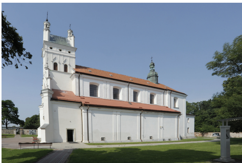
Fig. 6 Krasne, parish church of St. John the Baptist and the Elevation of the Cross as of 2018.