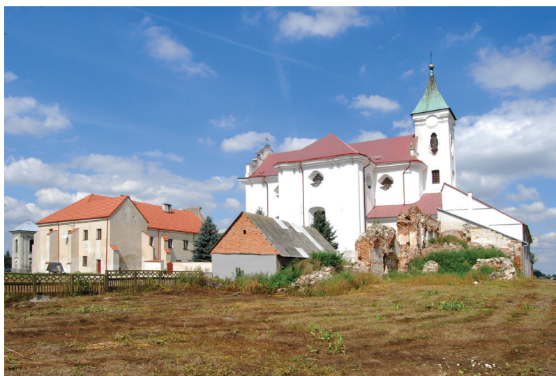
Fig. 5 Sieciechów Abbey, post-Benedictine complex, general view as of 2016.

The decoration includes a complete articulation of the interior with decorations of the vaults and apart from the religious, moral and didactic subjects, it also features an extensive historical scheme for the enjoyment of the monastery community. The painting decoration was created in several phases: rococo (main altar and shield wall of the facade dated 1770) and early classicist (vaults and side walls of the interior, choir parapet dated 1779). The author of the second phase was probably Szymon Mańkowski (ca. 1724-1788), who in the following years worked mainly as a painter-decorator for the king in Łazienki Park and for the magnate elite in their Warsaw residences 17 , but there is no data on the author of the first one. The paintings went through complex restoration in 1926 and 1943-1946. Around the church there are preserved remnants of the monastery buildings. The church and the remains of the monastery will require comprehensive conservation work (Fig. 5).