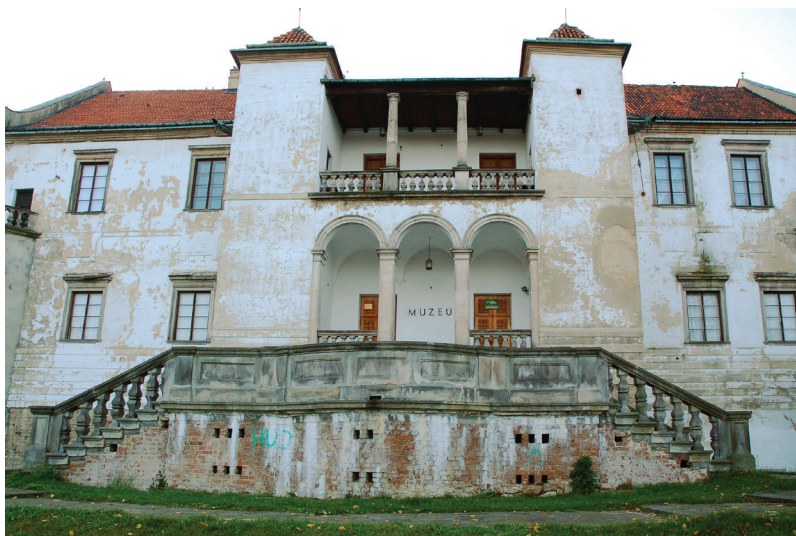
Fig. 12 Szydłowiec, castle, general view as of 2007.

I believe that this is one of the most valuable historical complexes in Mazovia. The church and castle of the Szydłowieckis family are highly valuable. The parish church, the castle, as well as the most important buildings of the city and the Jewish cemetery should be considered a Historic Monument.