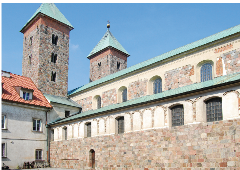
Fig. 8 Czerwińsk nad Wisłą, cloister church as seen from the courtyard, 2016.

and before 1538 and 1630-1633, renovated before 1765 and in 1768-1775 20 . Restoration works were carried out under the direction of arch. Stefan Szyller on the initiative of TONZP. It is the most valuable Romanesque building in Mazovia, also the largest monumental painting complex from the Middle Ages and modern times. In the interiors of the Romanesque-Gothic-early Baroque conventual church of the Annunciation of the Blessed Virgin Mary and the former abbot's capitular and lower hall in the representative eastern wing, called the abbots' palace, there are preserved paintings al fresco and al secco from as many as twelve different historical layers from the twelfth to the second half of the eighteenth century. The church and monastery still require complex conservation work.