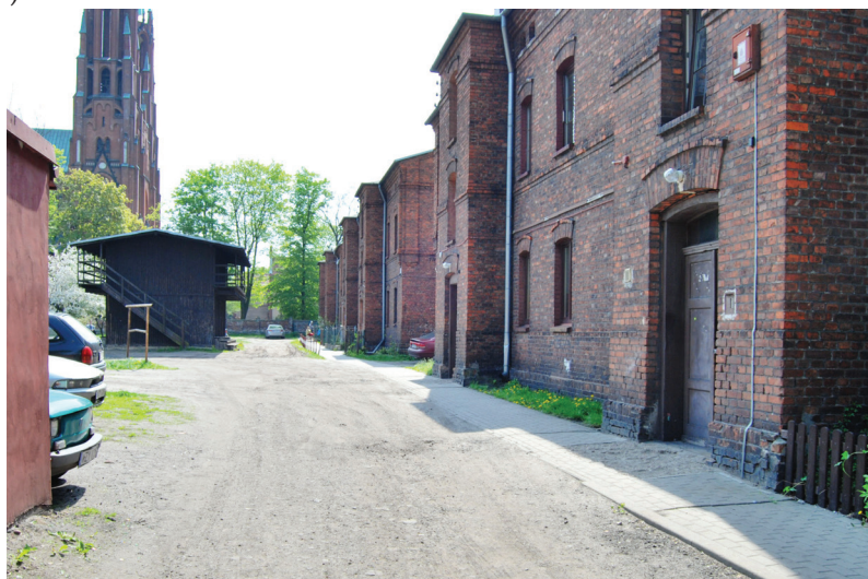
Fig. 1 Żyrardów, 19th c. factory settlement, as of 2014, workers' houses.

- Żyrardów - a 19th-century Factory Settlement declared a Historic Monument on January 4, 2012 3 . (Fig. 1)