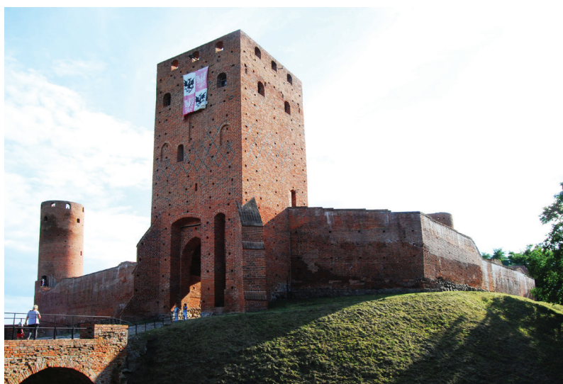
Fig. 4 Czersk, Mazovian Dukes Castle, general view as of 2018.

- The castle of the Mazovian Dukes in Czersk. Application dated 1 September 2017 was submitted to the Ministry of Culture and National Heritage on 21 November 2017.