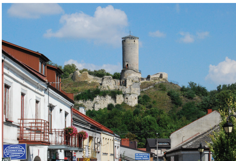
Fig. 11 Iłża, castle and city as of 2018.