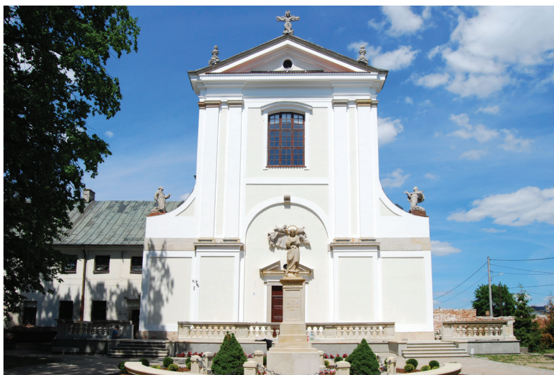
Fig. 10 Węgrów, Reformed Franciscans church, as of 2016.

Jan Dobrogost Krasiniński erected this magnificent brick Reformed Franciscan Conventual Church in Węgrów in the years 1693-1706 23 . The design was made by Tylman van Gameren and Carlo Ceroni. (Fig. 10) The interior paintings were made by Michelangelo Palloni between 1707 and 1711 and have been preserved in a very good condition, unlike the parish church, where they were heavily repainted. Also in the cloisters of the monastery, the wall painting decoration was detected, urging the need to expose and preserve them. The church is undergoing renovation and conservation work, and an even wider range of work in the coming years will involve the monastery and its decoration.