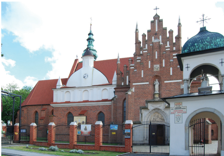
Fig. 9 Radom, Benedictine church and monastery, as of 2016.

Founded in 1468, the ensemble is one of the best preserved monastery complexes in Poland. The brick church and monastery were built in several phases 21 . The Bernardines themselves purpose-built a brickyard where they fired gothic bricks. First of all, a chancel with a sacristy was built, which was to serve as a treasury (currently the chapel of Our Lady of Angels). Then the southern wing of the monastery was erected. The next stage was the body of the church completed in the late 15th century. Lastly, the remaining wings of the monastery were erected, connected by a covered one-storey cloister with a small tower in the northeastern corner, characteristic for medieval Bernardine monasteries. The church was extended and rebuilt after 1506, before 1602, 1630-1633. The gothic character of the temple was restored between 1911-1914 under the direction of Stefan Szyller 22 . (Fig. 9) For a number of years it has been the subject of comprehensive conservation works.