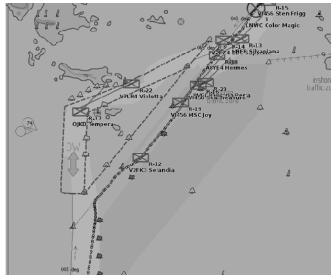
Figure 3. TSS Hatterr during baseline test

As a test case for the STM evaluation, a situation in TSS Hatterr in the Great Belt, Denmark has been chosen as baseline (Weber, unpubl.). Furthermore, as EMSN is applied for the first time in validating the STM, additional simulation runs have been made in that area without STM functionalities (so called baseline simulations). The purpose of these tests is to validate, if EMSN is producing traffic patterns and situations comparable to the real situation that has been occurred. This is an important characteristic, as otherwise the EMSN can't be used as a further risk assessment tool. During the first run, thirteen own-ships participated in this four days test series with promising results (see figure 3).