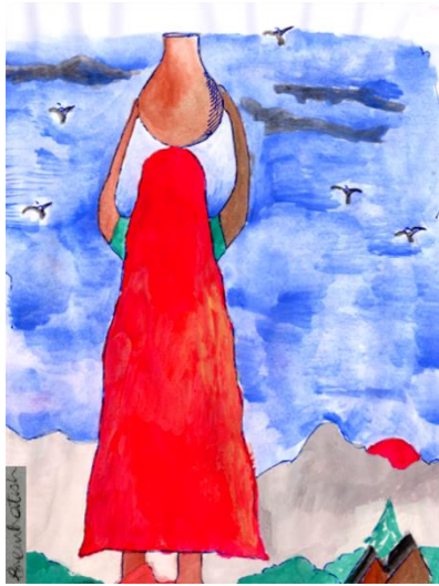
Figure 2. Two hours spent daily just to fetch water (done by the author himself)

worldwide spend at least two hours daily just to fetch water (Krishna, 2012). Figure 2 serves as an illustration to White's observation.