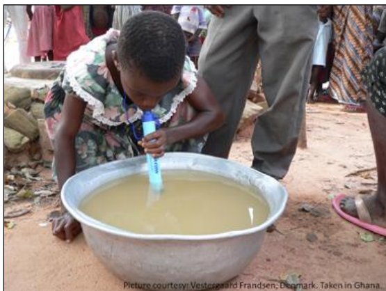
Figure 1. 'Lifestraw' being used in Ghana.

BC, and the father of modern medicine doctors swear by before commencing their practice, Hippocrates. This is what he said about water – Whosoever wishes to investigate medicine properly, must consider the water being used by inhabitants – for water contributes much to health. Over 2 centuries down the line, that goes unchallenged. As gathered from the website – www.water.org , in the developing world, 24,000 children under the age of five die every day from preventable causes like diarrhoea contracted from unclean water. The direct and indirect costs of keeping the current deficit of safe water provision in developing countries, such as health-related costs, represent nine times the cost of providing universal coverage, according to a United Nations Development Programme report (UNDP, 2006). Provision of safe water thus, prima facie , seems to be a Hobson's choice – if governments are really deeply concerned about the health of their citizens. However, efforts made by entrepreneurial do-gooder technocrats have resulted in the diffusion of hope and happiness among the underprivileged.