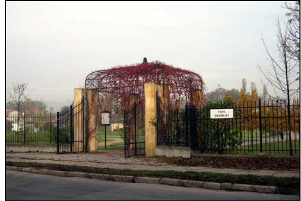
Photo 5. The New Dębnicki Park in Kraków, established as a civic initiative.

Source: designed by K. Pawłowska, K. Dąbrowska-Budziło, A. Zachariasz, K. Fabijanowska