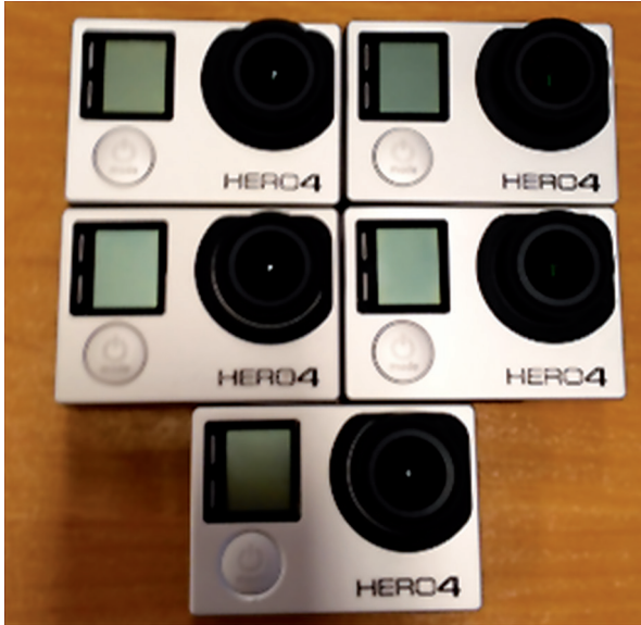
Fig. 1. Five cameras GoPro 4 Hero Black

In carried out research five GoPro Hero 4 Black cameras were used (Fig. 1) equipped with wide-angle lens and rolling shutter. The CMOS sensor is reading images by rows.