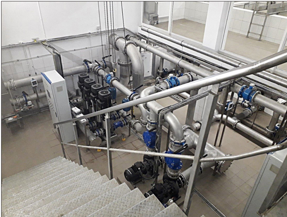
Figure 2. Sample photo from WTP after modernization – pump hall

The wastewater generated in the chlorine station is discharged to a designed outflow neutralization tank. After flowing into the tank, they are neutralized with a 3% aqueous solution of sodium thiosulfate in the amount of 3.5 kg per 1 kg of Cl 2 .