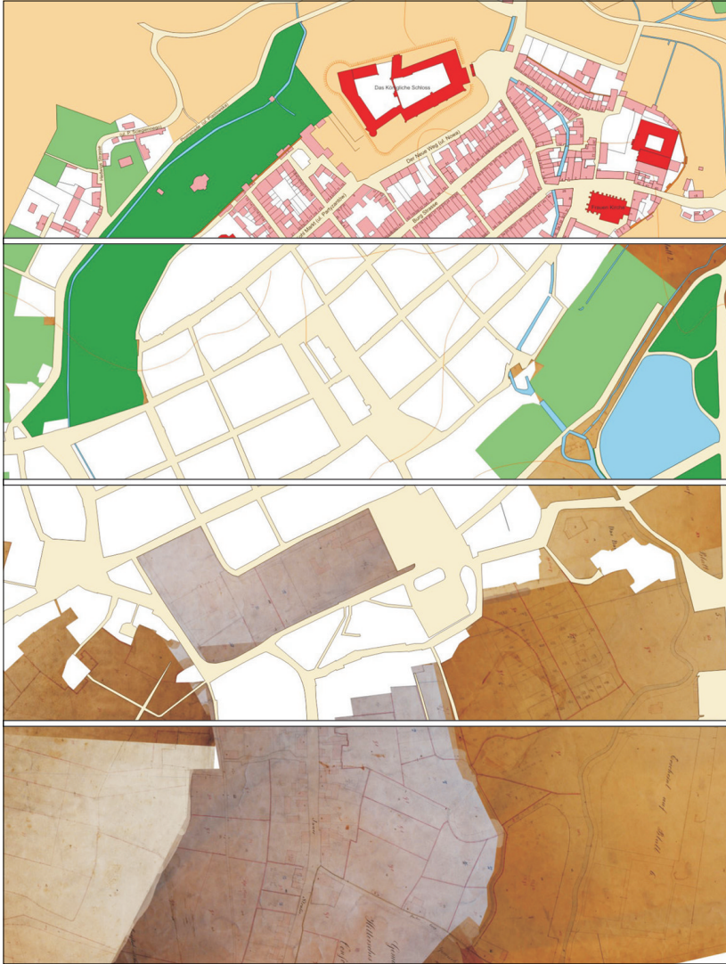
Fig. 3. Legnica. Reconstruction of cadaster plan, based on 1863 map. Cartographical edition Marcin Siehankiewicz