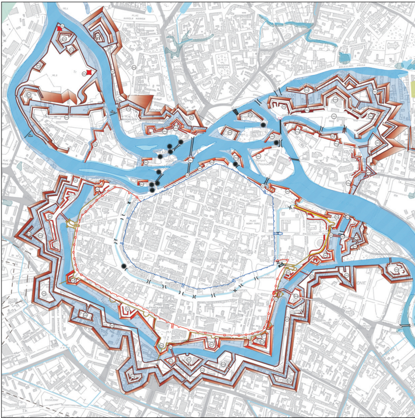
Fig. 4. Reconstruction of Wrocław fortification system since half 13 th until the beginning of 19 th century. Base – situational-altitude measures map from 1970. Cartographical edition Jarosław Połamarczuk

The most important source for the reconstruction work were mentioned above topographic maps by Christian Friedrich Wrede (1747–1753) and Urmestischblatt (twenties and thirties of 19 th century) and other special plans prepared for Milicz, Wrocław and Legnica. For Milicz it is, for example, the plan of the second half of the eighteenth century, kept in the National Archives in Wrocław (Odra river board regulations I/185), for Wrocław plan from 1794 (State Archive in Wrocław, the Odra River board regulations I/131), for Legnica stored at the State Archives Legnica fragments cadastral plan from 1863. All these above mentioned reconstruction fundamentally change our contemporary perspective on these city. Reconstructions performed by superposition of historical information and current topographic map, however, are only a rough picture of the historical space. Nevertheless, it is a serious basis for contemporary planning.