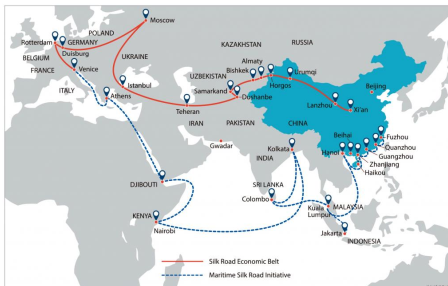
Figure 1: Logistic networks in BRI