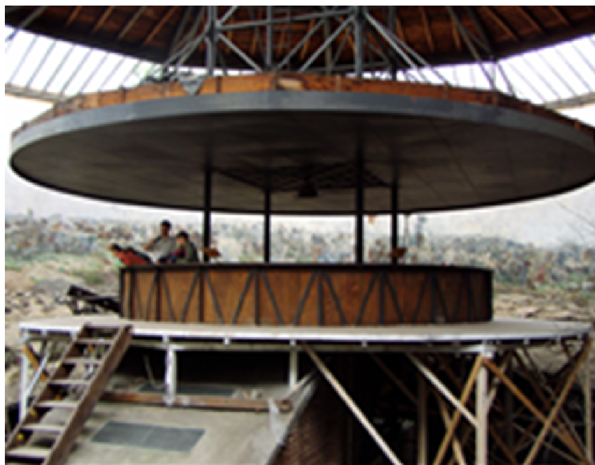
Figure 1: Panorama in Prague