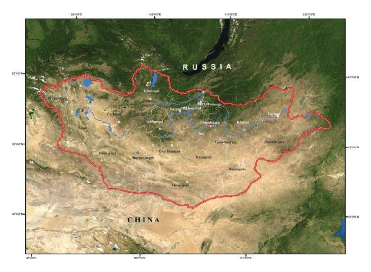
Fig. 2. The map of Mongolia

Mongolia has a territory of 1.566.600 squire kilometers. Forest cover 8.5% of the total land area. Mongolia's forests are under-utilized, vulnerable and forest resources are largely mature forest. On average, forest resources per hectare are small and primarily based on natural regeneration. Mongolia's Sustainable Development Concept 2030 foresees that State Special Protected Areas increase from the current level of protection of 17,4% of total land space to 25% between the years 2016 to 2020, 25% from 2021 to 2025 and 30% from 2026 to 2030.