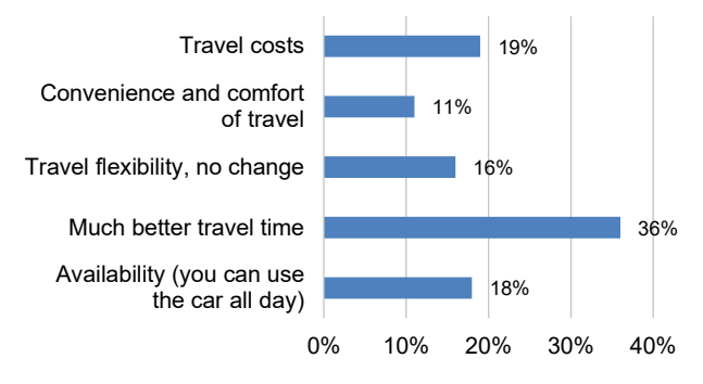
Figure 2. Reasons for using a car as the method of transport in daily commutes to work/study

by a high frequency of runs and a direct or integrated connection to their destination. The respondents' answers allowed us to understand the motivations of those who predominantly use individual transport to commute to work (Figure 2).