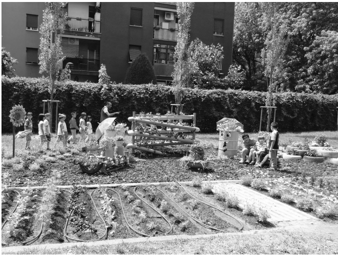
Il. 2. Green area made by citizens during the project "My Neighbourhood, My City". Now children go safely in the green space in the middle of the district.

respect of these urban facilities are in fact the actual way to build a sustainable city up.