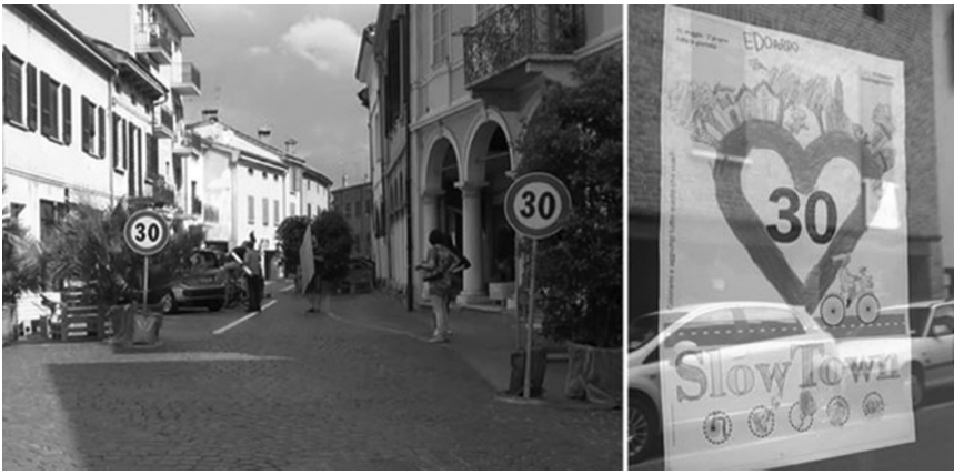
Il. 3. 30 km/h zone in Casalmaggiore.

experimental process took place once in the middle of the Po valley in the city of Casalmaggiore, once in Terni in the middle of the Apennines and then in Modena in the last months.