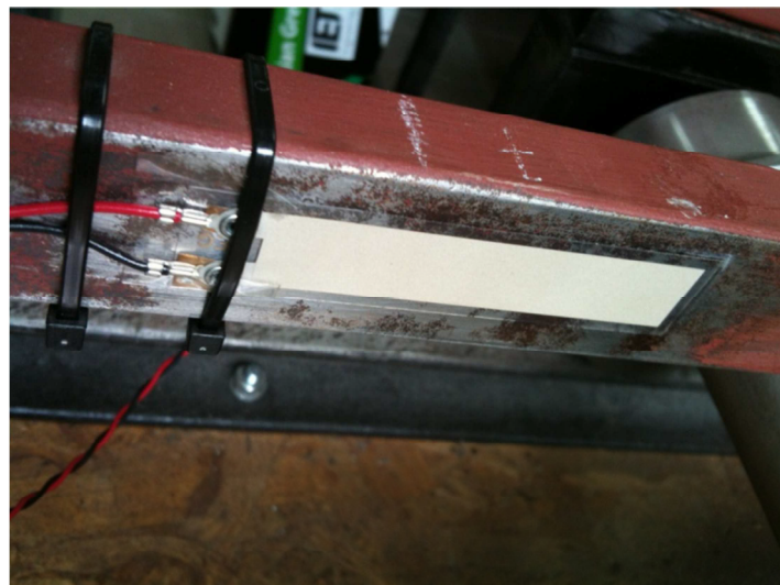
Fig.5. The CAD model of the laboratory stand with measuring points

PVDF piezoelectric film, and more particularly the sensor LDT, which was used in this study consists of three layers: polyester laminate, a piezoelectric film and a protective coating. The PVDF piezoelectric film elements produce more than 10 mill volts per micro strain and about 60 dB higher than the voltage output of a foil strain gage. Their capacitance is proportional to the area and inversely proportional to the thickness of the element. Such kinds