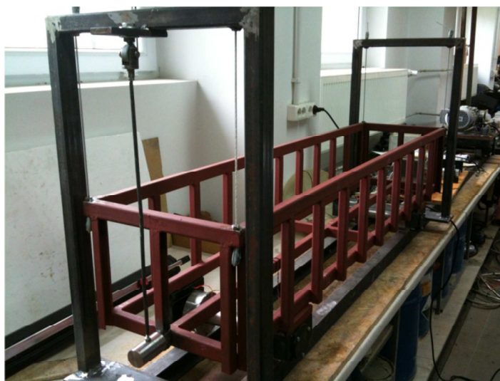
Fig.3. The simplified laboratory model of the supporting structure

In order to verify assumptions of the designed mechatronic system based on analysis of the dynamical response of the freight car a physical laboratory model of the supporting structure of the considered 1415 A3 freight wagon was built in scale. It is presented in Fig. 3. There are a lot of simplifications in the created model juxtaposed with the real object. The purpose is that the laboratory model was created only for initial verification of the possibility to measure the dynamical response of the wagon using piezoelectric films. In the future works measurements on the real object will be carried out.