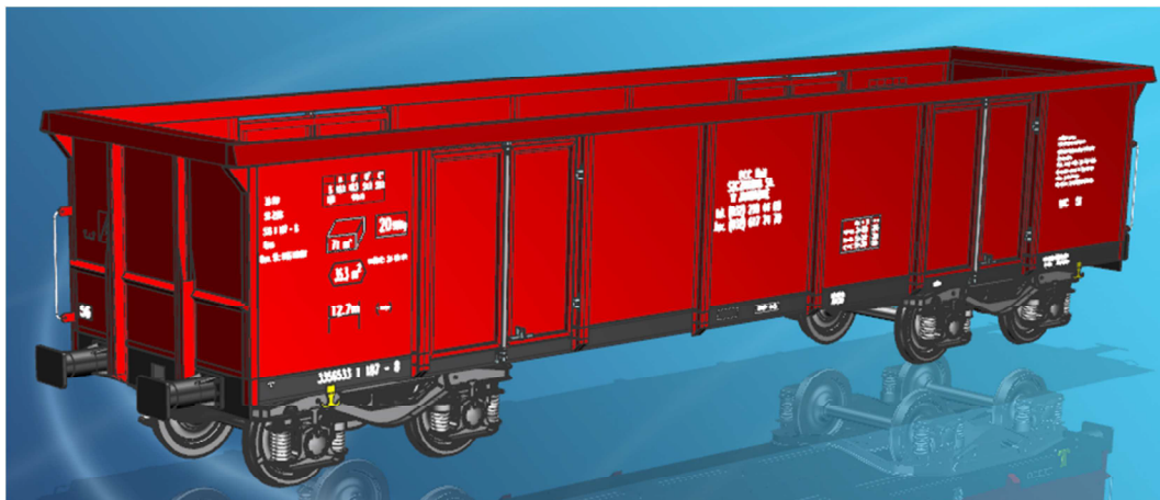
Fig.2. The CAD model of the considered type of freight car

presented in Fig. 2. The created 3D model is very detailed and obtained discrepancy is 5,34% of the real wagon mass. The difference is the result that the model does not include the braking system (pipes and pneumatic cylinders, brake pads etc.) After its verification the model was used in strength analysis using the Finite Element Method in NX software. Obtained results will be presented in others author's publications.