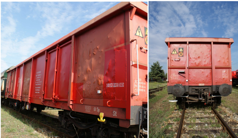
Fig.1. The considered freight wagon and damage of the body shell

At the same time the type 1415 A3 wagon has a high strength of the supporting box (top girder, lateral reinforcing strip etc.). The considered type of freight wagon and its typical damages are presented in Fig. 1.