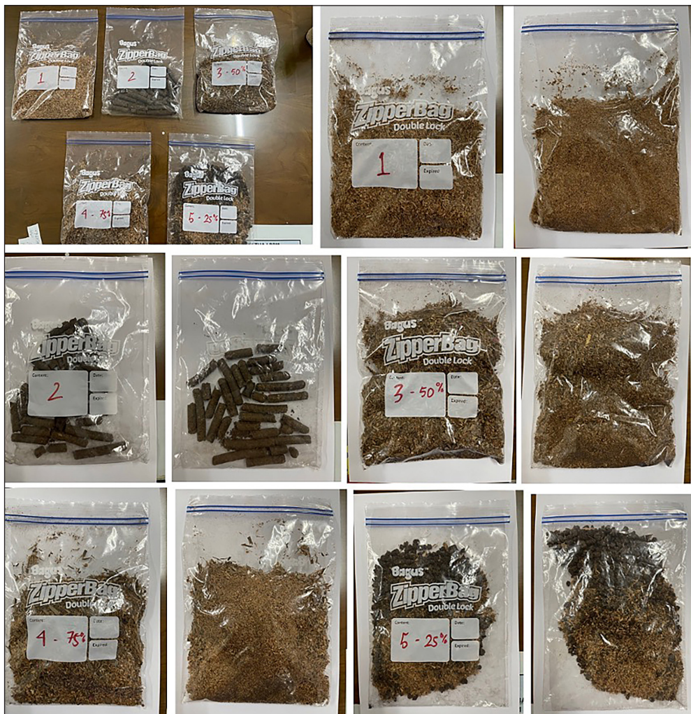
Figure 1. RDF material samples

Biomass briquettes are made using a press machine to print biomass into a pellet shape with a length of 5–10 cm and a diameter of 1 cm. The dried temple waste then proceeds to some machines to produce the RDF. A shaft cutter machine (MCC) series 6-200 with GC-200 Engine and 6.5 horsepower (hp) was used to grind the