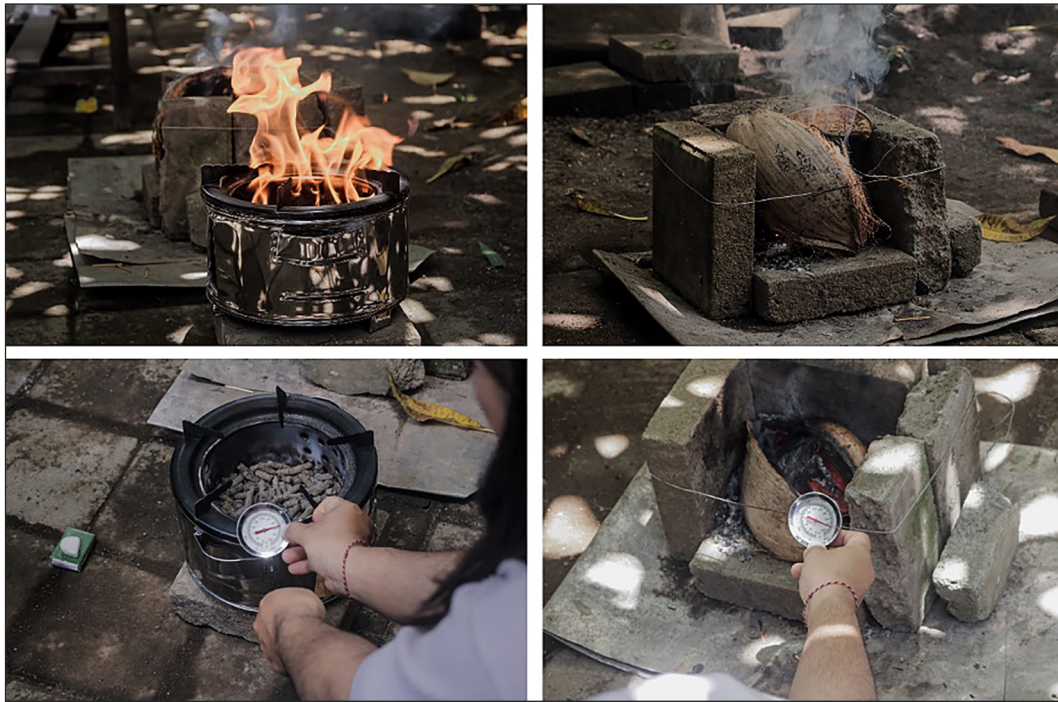
Figure 2. Product combustion and durability test

reduce the presence of contaminants and increase their durability in storage. Infrastructure for storing RDF, such as appropriate flooring, drainage systems, fire prevention measures, and adequate space for equipment manoeuvrability, is essential for guaranteeing its durability. Monitoring RDF on a regular basis is necessary to detect degradation or changes in its properties over time. This may entail periodic sampling and analysis of RDF samples in order to evaluate variables such as moisture content, energy content, and physical properties. By implementing appropriate storage practices and maintaining suitable storage conditions, stored RDF can be optimized, ensuring that its quality and energy content remain suitable for combustion or other uses.