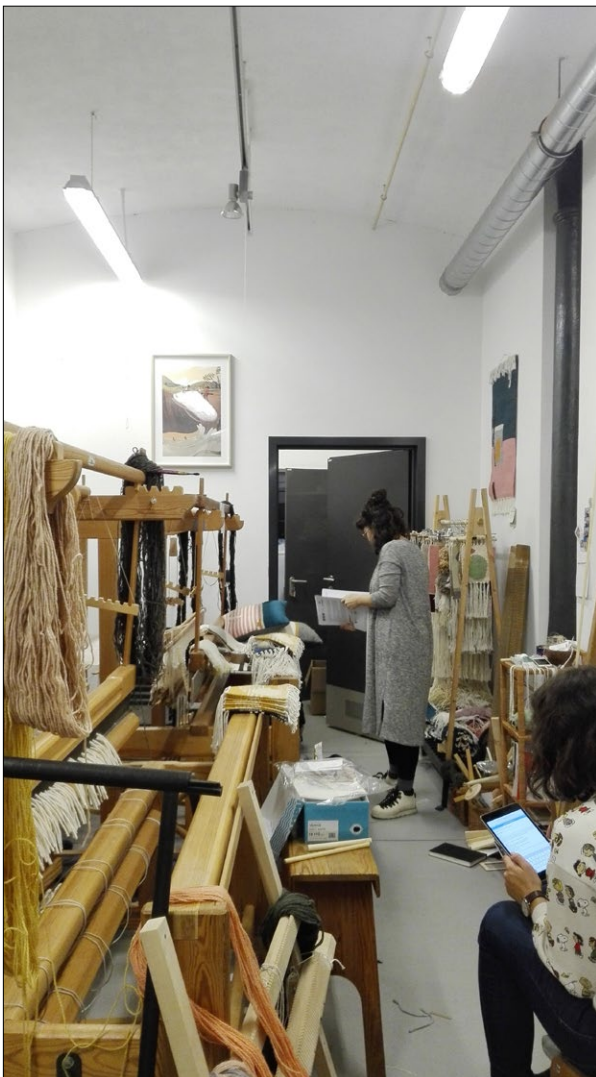
Fig. 2. Art-incubator, Lodz; photo by O. Ivashko 2019.

humanization of the living environment of the population is becoming urgent.