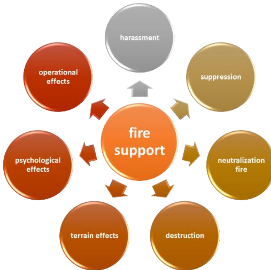
Figure 1. The Physical and functional effects of Fire Support (The author's own work based on AARTYP-5, 2015, p. 87).

porarily ineffective or unusable. Neutralization fire results in adversary personnel or materiel incapable of interfering with a particular operation or the accomplishment of a particular course of action (AARTYP-5, p. 87).