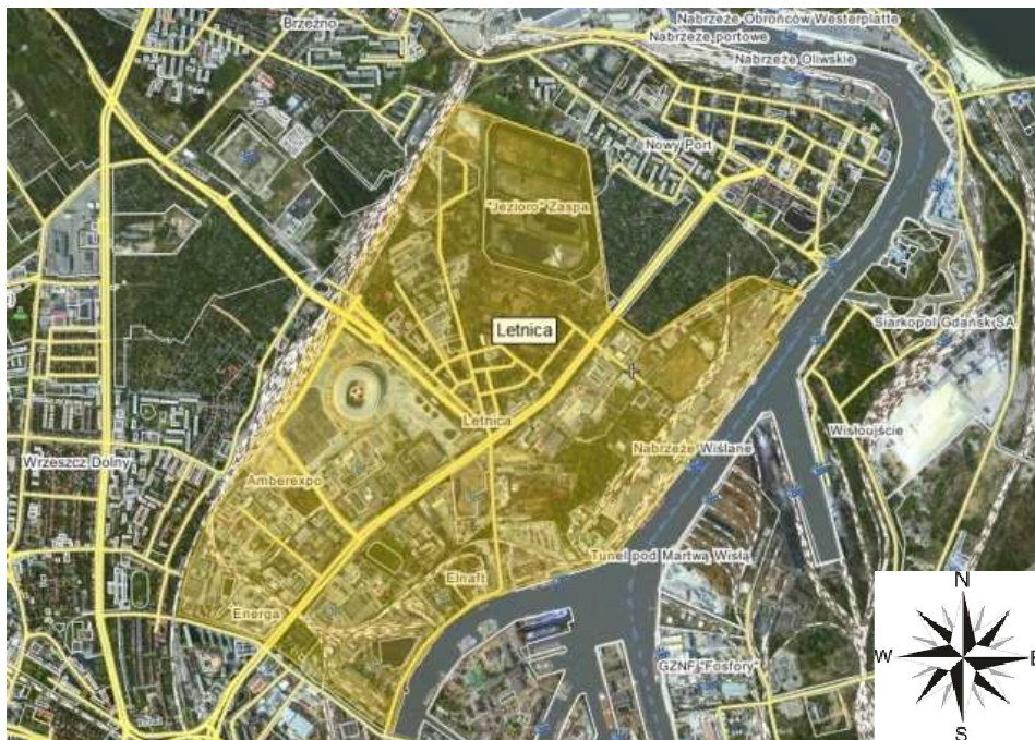
Fig. 1. Location of the Letnica district and the PGE Arena stadium.

Yet in 2002 the plan was adopted, but the City Council was still uninterested in the area. There were a lot of such areas within the Gdańsk city boundaries, which lost its original functions as a result of various transitions and were (and still are) endangered with total or partial degradation. This is only the decision of the stadium erection which triggered the commence of Letnica regeneration [2].