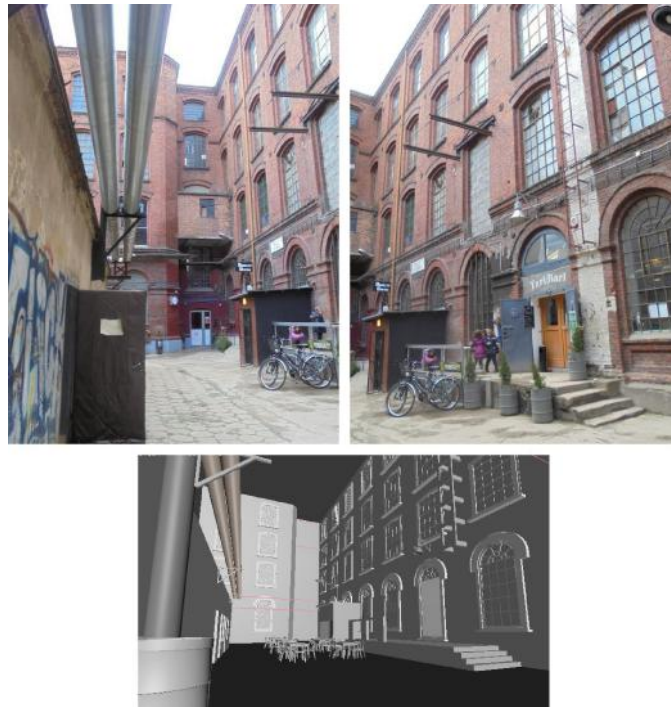
Fig. 1. Real picture of location used and render of modeled location