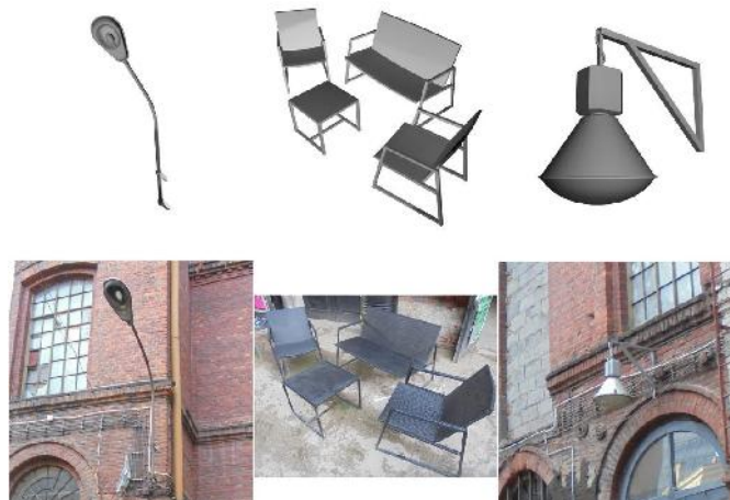
Fig. 2. Details of environment.

Scenario , and the whole interaction were developed within the Unity game engine. The use of an existing game engine allowed us to focus on designing the experience and is sufficiently robust and open to further alterations. Suitably, it has the official support for Leap Motion and Oculus Rift. However, since we utilized the DK2 version of Rift (development kit 2), not everything was out-of-the-box and some work was required to assure that both devices are working together properly. The effect of paint was achieved with particle effects. Emitters were set to trigger paint emissions when a swipe gesture is recognized with the Leap Motion controller. The generated particle colors were randomized to make the whole experience more interesting. "Paint" stuck to the surface of our models on touch and was affected by gravity. This idea for the scenario is based on the thought that among the basic needs common to humans is the need to create, alter the surroundings. Changing the color of the environment through movement is easily recognizable. We believe that users will easily link those in cause-effect chains, which should result in further acceptance of the presented virtual environment. To assure that user is undistracted and focused on his surrounding and task given no Head-Up Display (HUD) was used. That means that interface consisted of modeled world, paint (visible after proper gesture is executed), hands models, and input devices.