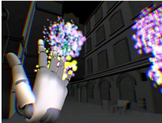
Fig. 3. User interacting with environment - painting the location with gestures.