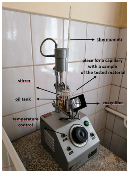
Figure 1. Tottoli apparatus

Melting point is one of the characteristic physical properties of organic compounds and a good criterion of their purity. Pure crystalline organic compounds will melt within a narrow range of 1 °C. A 10 mm glass capillary was filled to half of its volume with the test material and compacted by gently tapping on a ceramic plate. The capillary was inserted into a Tottoli apparatus (Fig. 1) filled with a heating medium, i.e. oil. The apparatus stirrer was started and the temperature measured until it had stabilized. The system was heated at a rate of 1 °C/min and was continued until a phase change was observed in the sample. The melting point was taken as being in the range between the point at which the melted sample starts to flow down the capillary walls and the point at which the capillary is completely filled with liquid. The test was repeated 5 times.